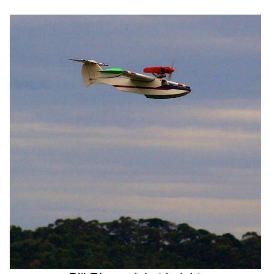
Bill R's model at height