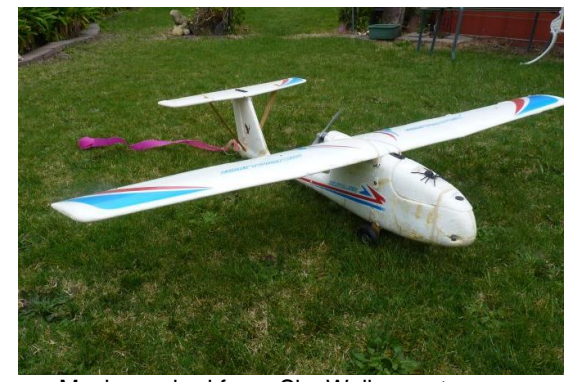
Much repaired foam Sky Walker + streamer