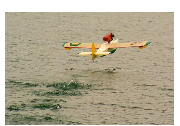
Peter Harris's model lifting off

March 2015 Flying on the water at Camperdown