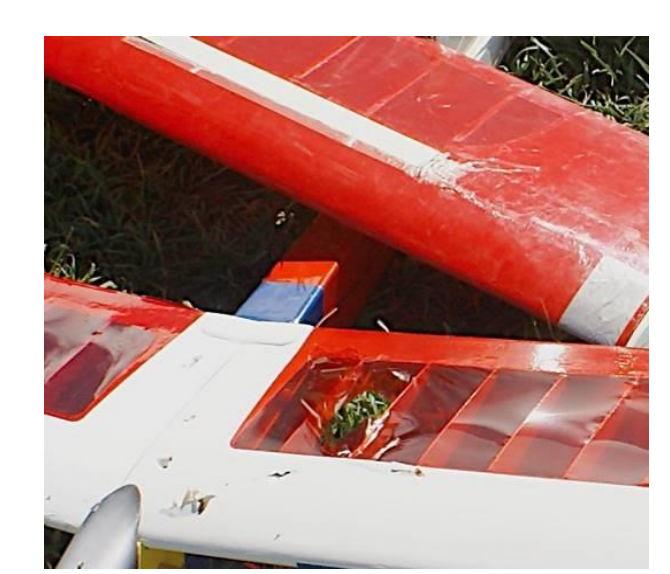
Some of their models had an argument with one of the local wedge tailed eagles, ouch