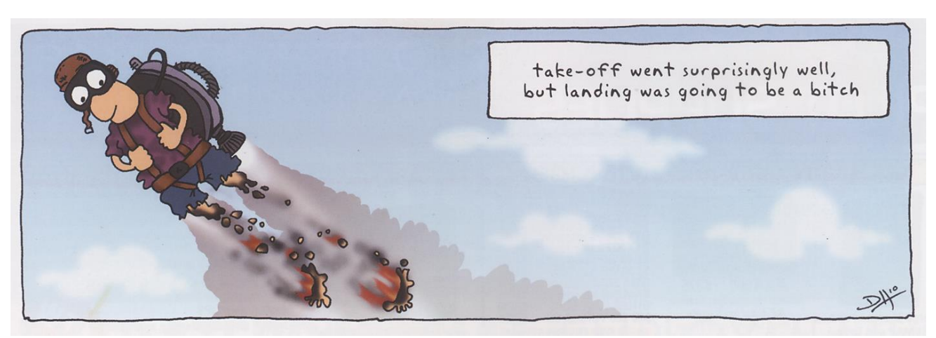
An oldie but a goodie