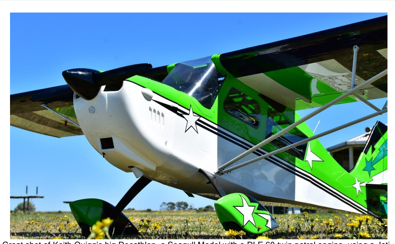
Great shot of Keith Quigg's big Decathlon, a Seagull Model with a DLE 60 twin petrol engine, using a Jeti DS24 radio system, at our flying field recently