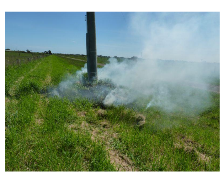
The fire in full swing, luckily it is not February!

Later an Electric Supply service truck arrived, made repairs, and the power was restored