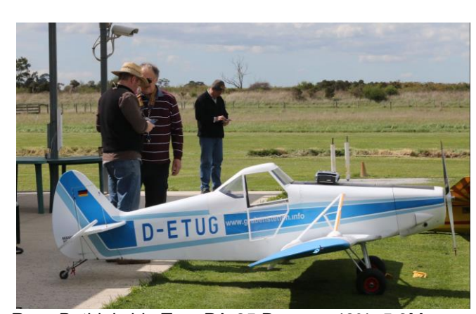
Ross Bathie's big Tug, PA-25 Pawnee 43%, 5.3M span, 340cc twin engine