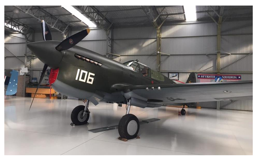
Cargo & Freight Company Tyabb

The Club Committee are looking into buying a Defibrillator, that would be situated in the club house.