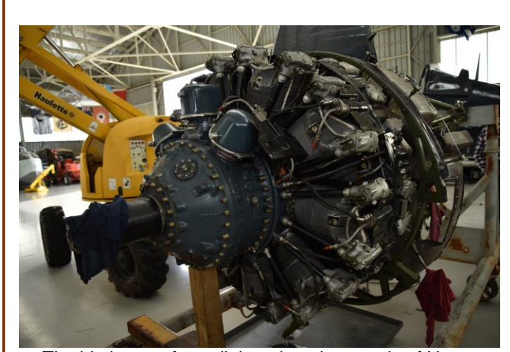
The big beast of a radial engine, thousands of Horse power, note the massive prop' shaft

Water injection was used historically to increase the power output of military aviation engines for short durations, such as during dogfights or on take-off