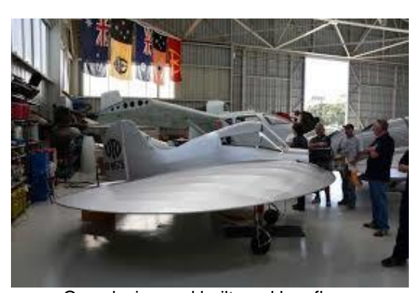
Own design and built, and has flown