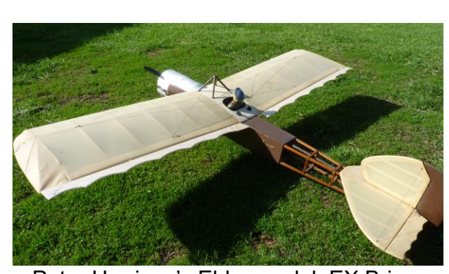
Peter Harrison's Elder model, EX Brian Evans, Top Flyte, O.S Max 25, 9x5 prop', 100% oil soaked