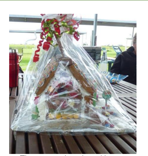
The ornate gingerbread house