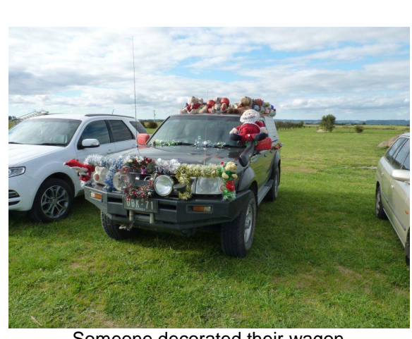
Someone decorated their wagon