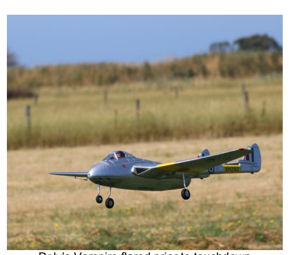
Roly's Vampire flared prior to touchdown