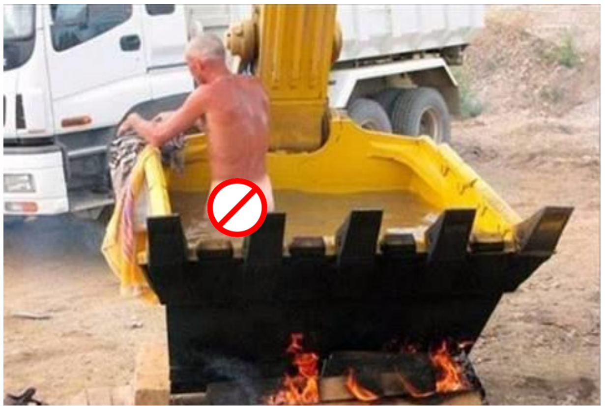
Not sure the bucket on our Kubota is big enough for this activity