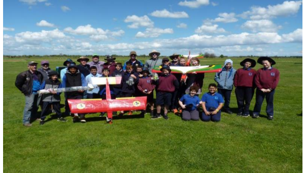
Teachers / students / minders, and models

P&DARCS encourages schools who wish to be involved in an introduction to aero modelling to contact them.