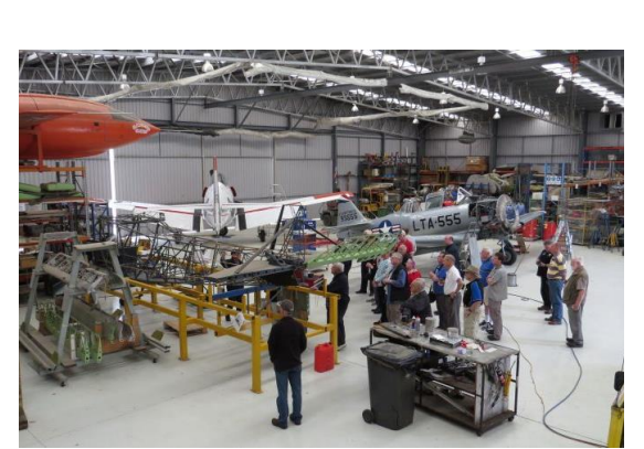
Inspecting a restoration airframe