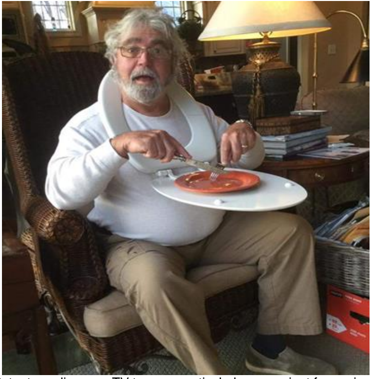
Patent pending new TV tray......particularly convenient for seniors!