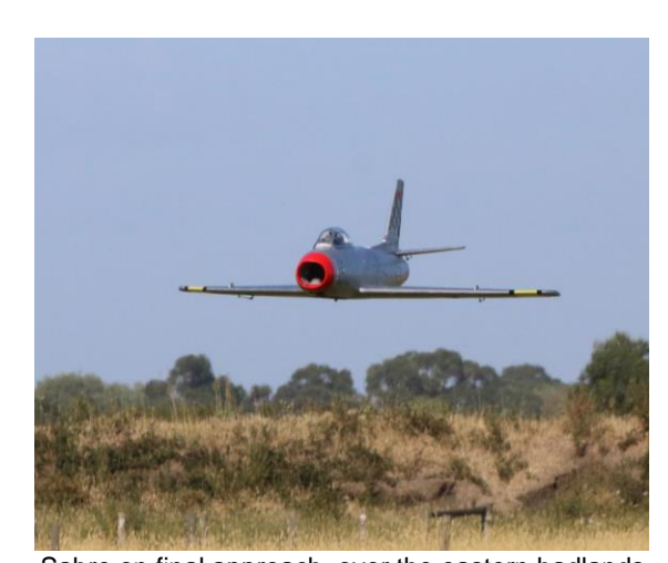
Sabre on final approach, over the eastern badlands