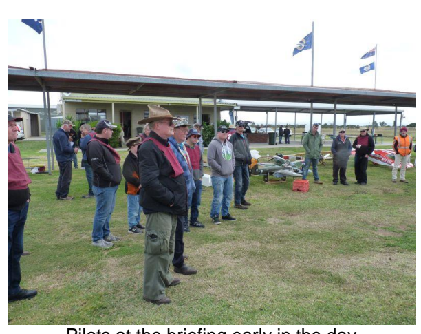
Pilots at the briefing early in the day