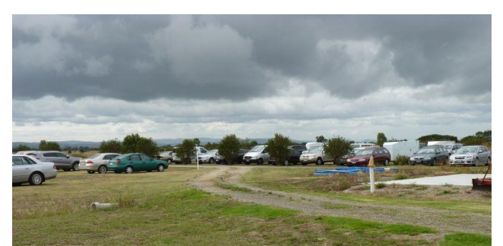
A busy carpark, the weather was overcast but the rain held off for most of the day