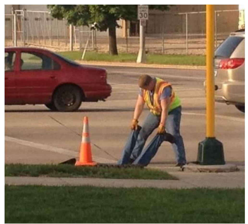
We could use this method to access our water pit on Wenn Road, save hassles with safety gear