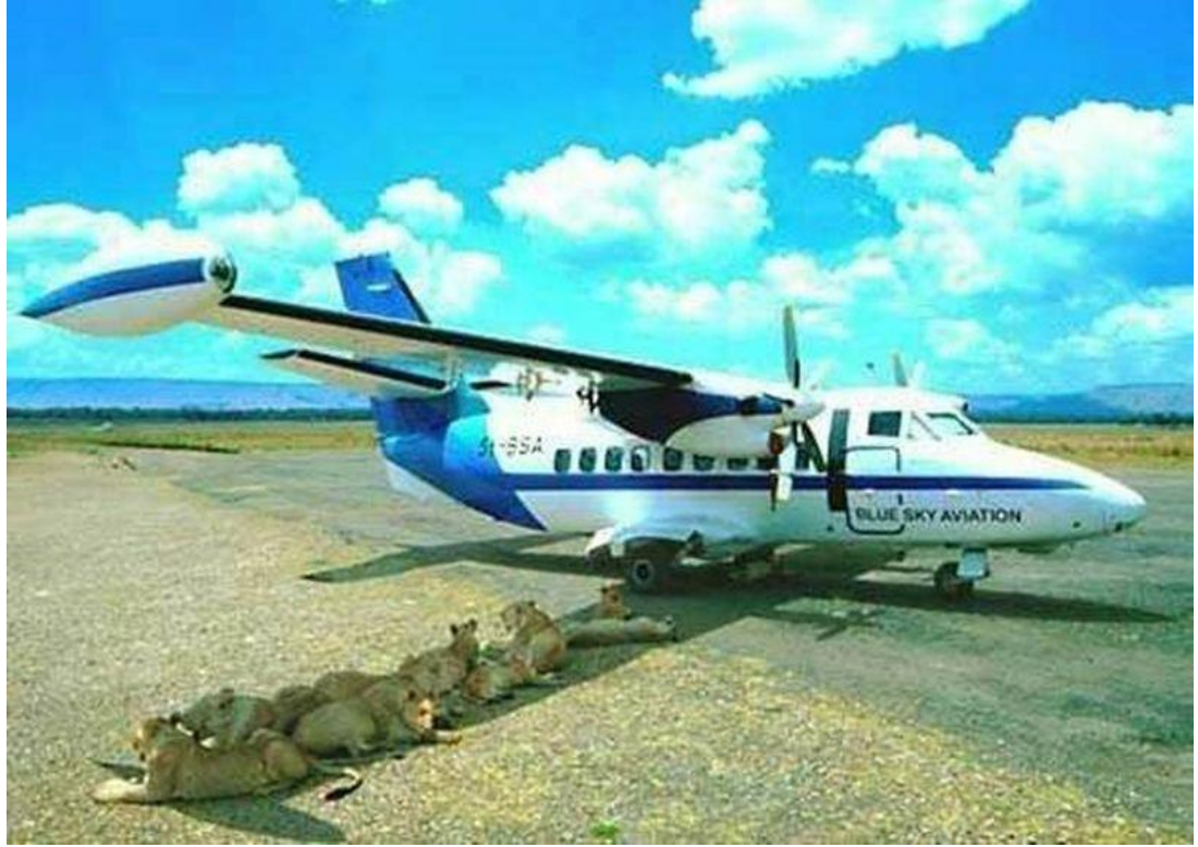
A South African Bush Pilot, wanting to return to his plane, after dropping off some supplies, found some unwelcome visitors enjoying the shade, how to get to the doorway??