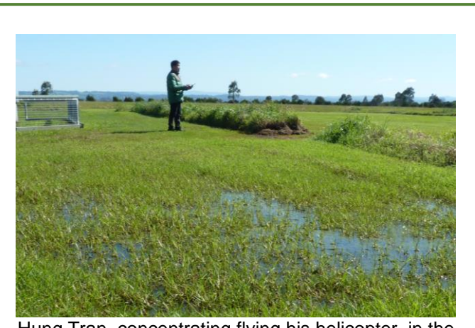
Hung Tran, concentrating flying his helicopter, in the damp conditions