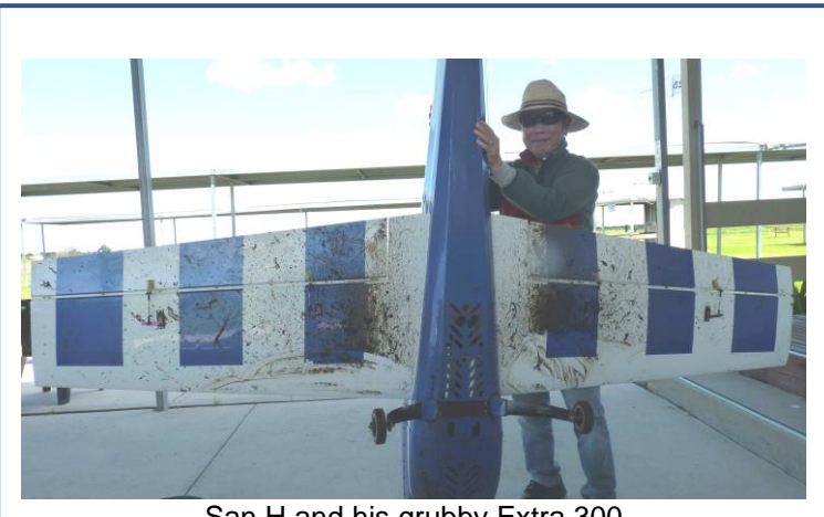
San H and his grubby Extra 300

A slight problem occurred on landing when the model touched down. The main wheels cut deep grooves into the soggy surface, splattering the underside of the model with smelly black muck. As you can see, it was a big clean up job.