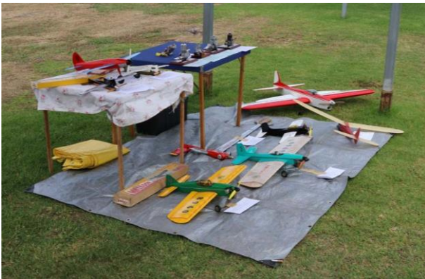
Robin Hiern's display of vintage control line models and reproduction motors