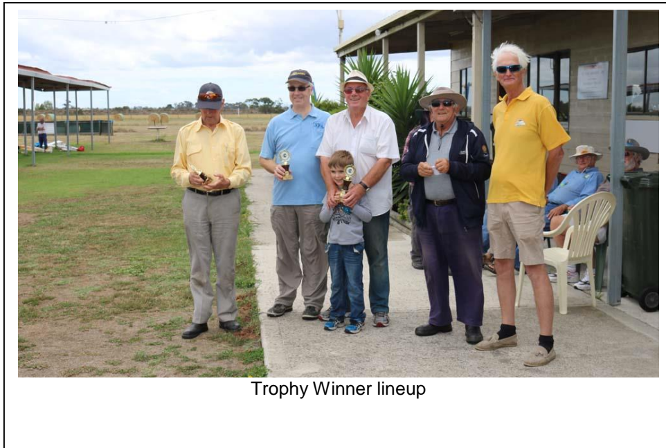
Trophy Winner lineup