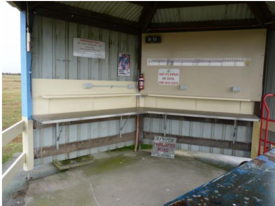
Additions to the pound, shelving, power points, and simplification of the keyboard