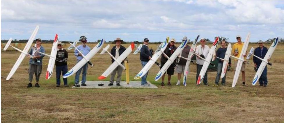
The foam glider line-up