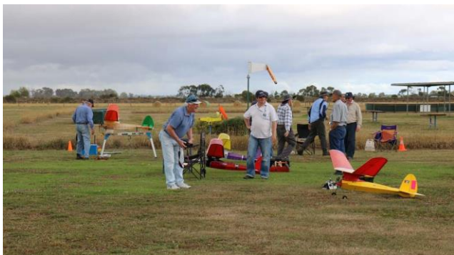
The Roy Rob' flight line