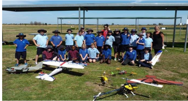
Last year's group at our field, on Wed' 11 th March

The group who visited last year had a ball, with lolly drops, flight training on fixed and rotary wings, Iron Man drop / retrieve, simulator training, Quad copter + GPS, plus a BBQ nosh up