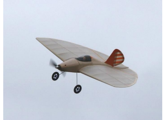
Alan Stutley's scratch built Arup flying wing, on maiden flight