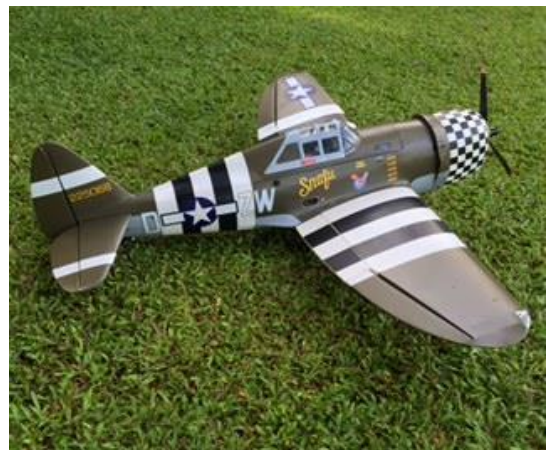
The P47 finished, a good looking machine