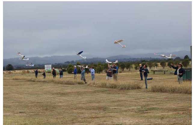
Mass glider launch at the Western strip