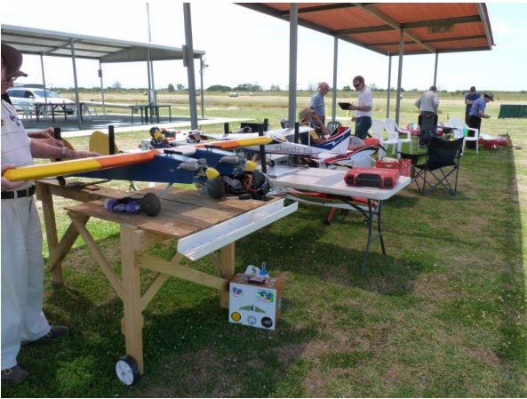
Busy Bay 13