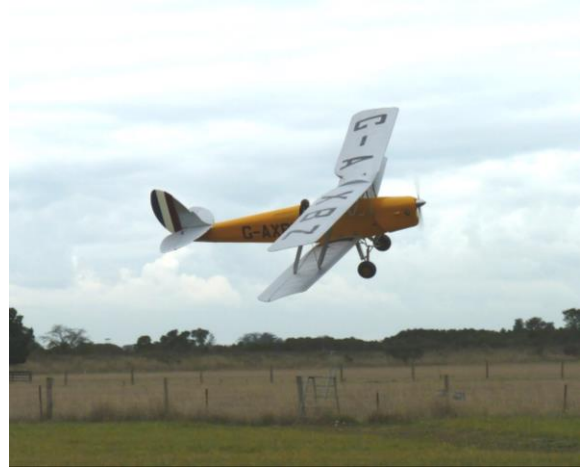
The Moth in flight, a very nice model