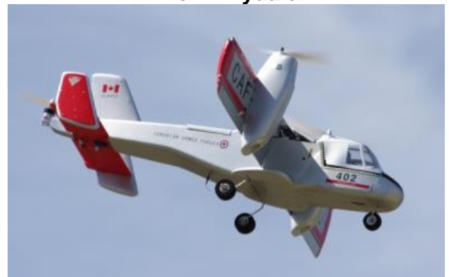
Vertical take-off model no details Lilydale Model Aircraft Display March 2016, from Australia Model News No 39 An Interesting machine