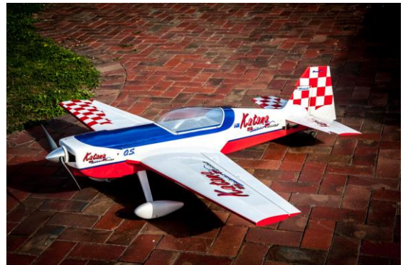
Cliff's Katana, for sale

Cliff Mclver Tel' 9850 4478 Mob 0417 113 900