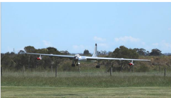
Over the runway threshold, reducing power