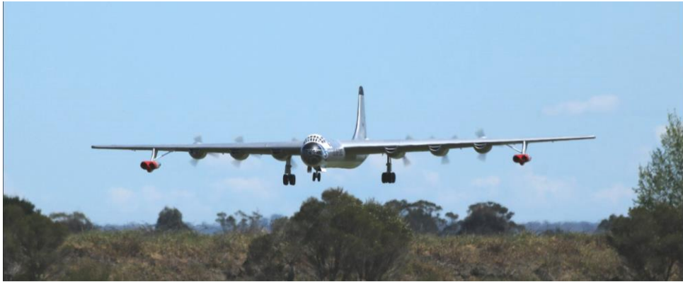
Out over the western bank on final approach to the main runway