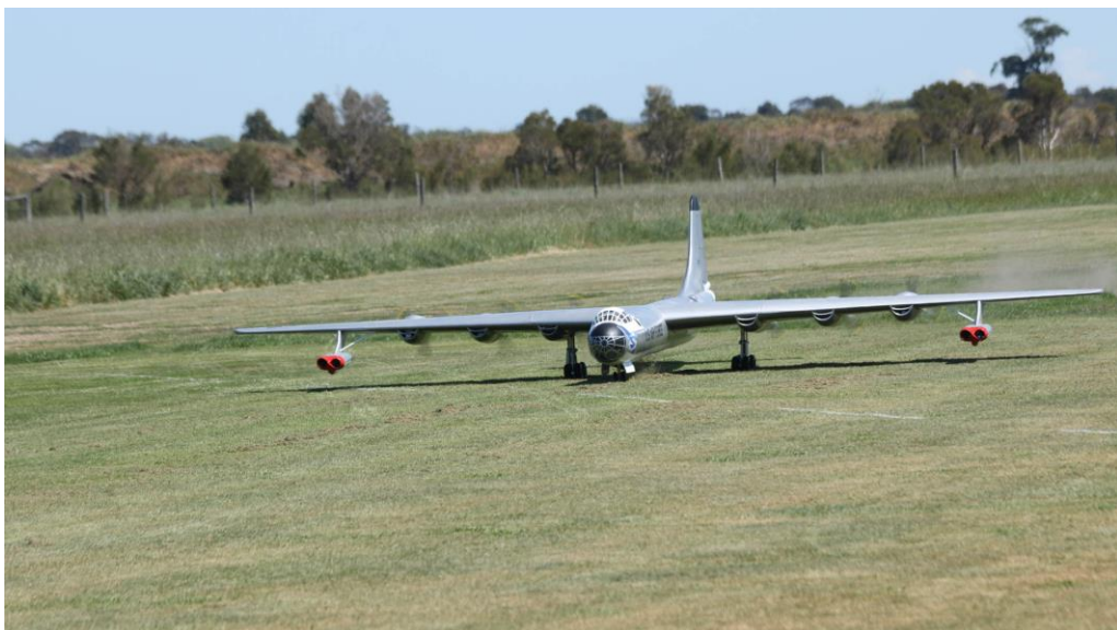
On landing roll – out, a perfectly controlled landing, conclusion to the first test flight Much merriment and back slapping, by all involved