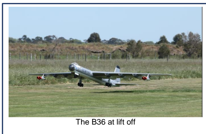
The B36 at lift off

David Law opened the throttles, the motors roared, and the model accelerated rapidly, lifted the nose wheel clear, running for a few seconds on the mains, then lifted into the air, what a sight