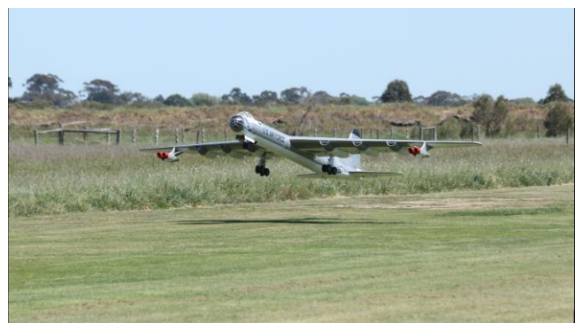
Lift off, the B36 is airborne for the first time, What an awesome sight