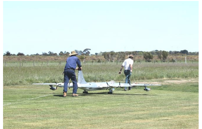
Paul Somerville and Andrew Smallridge moving the B36 to the Western end of the main runway, as battery consumption was unknown at this stage, it was decided to avoid taxiing, to conserve power