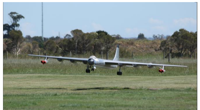
About to touch down, slight drift to port