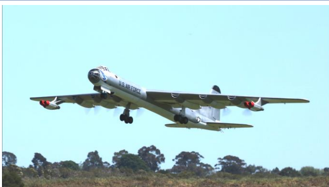
Climbing away, the B36 is stable, and looking magnificent in the air