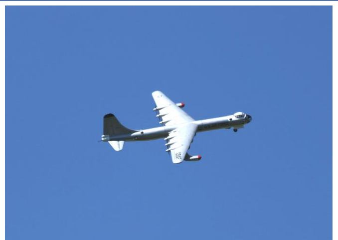
B36 at height, heading West