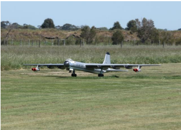
Take off run, the B36 has rotated, on the rear mains, all systems are go, ready for lift off