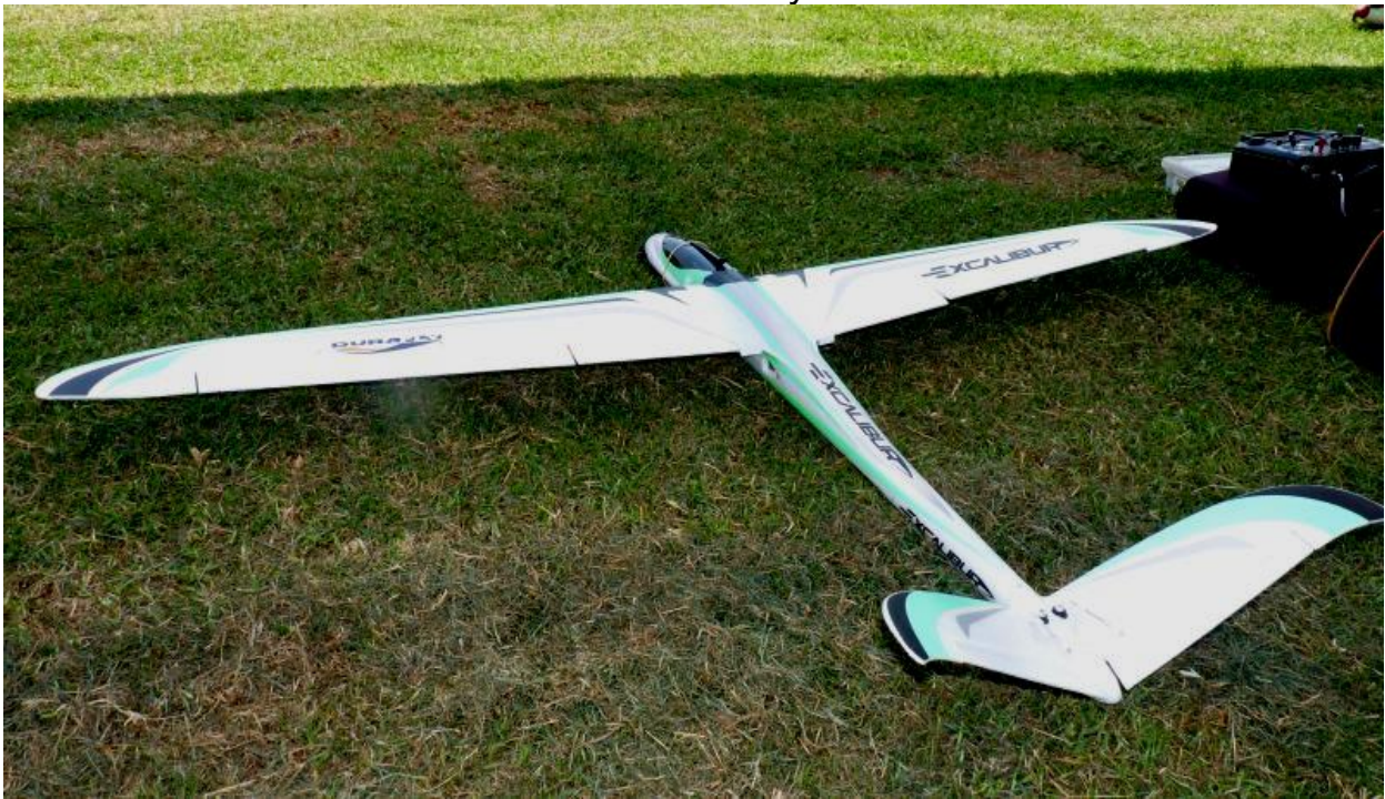
A Durafly Excalibur glider