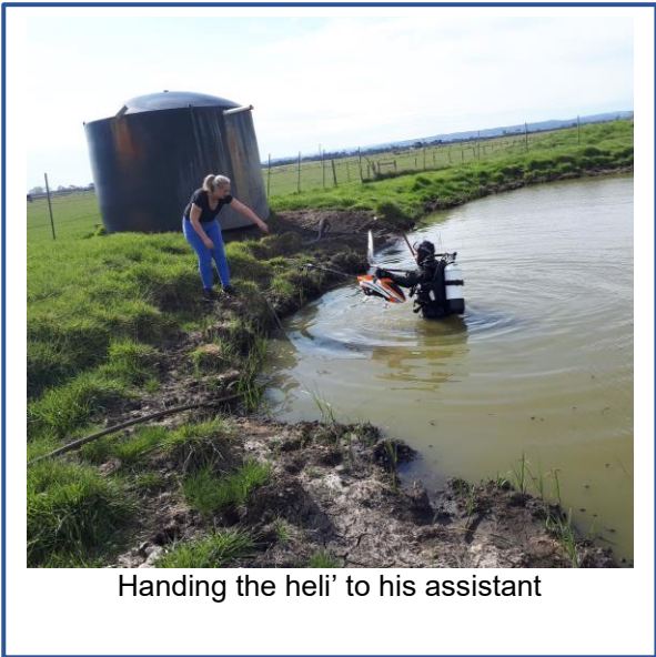
Handing the heli' to his assistant