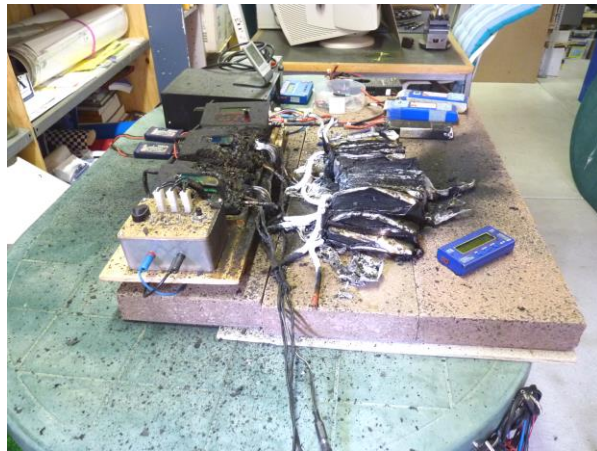
The burnt remains of 3 LiPOs and chargers, note the black burn marks on the plastic table top

In the next Newsletter ( April ) there will be a 3 page article on LiPO's, safety