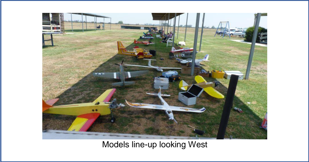
Models line-up looking West