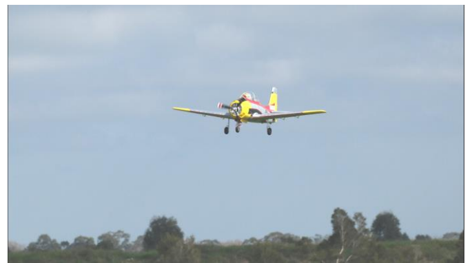
Trojan on final approach, Michelin's dangling