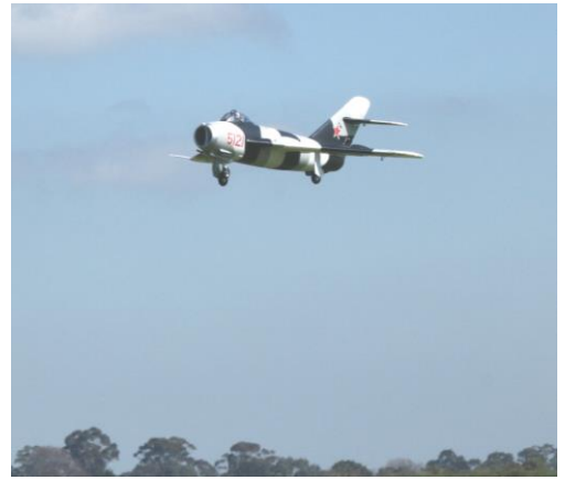
MIG on final approach, Dunlops dangling