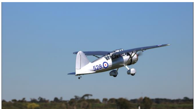
Lysander climbing away, it flew well