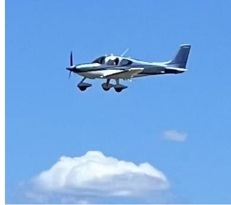
Cirrus at height