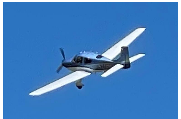
The Cirrus climbing out