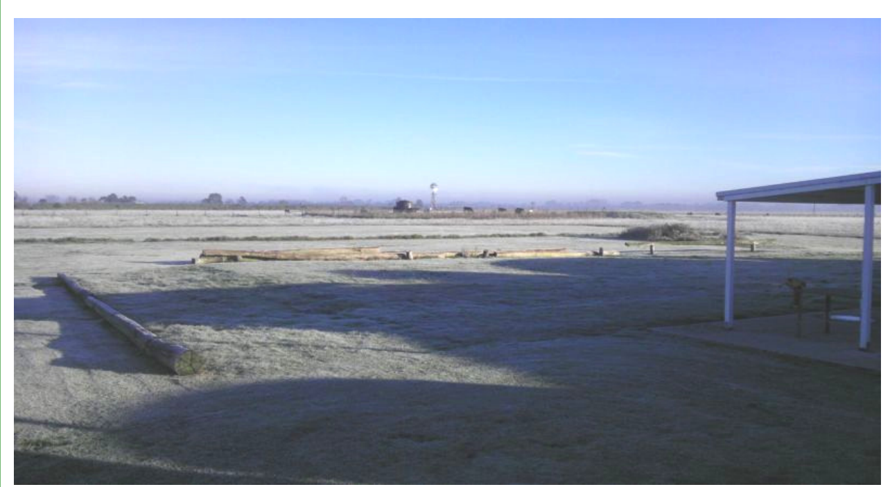
An early July morning at our flying field, looking West, cold and frosty The sun later thawed it out for a perfect flying day