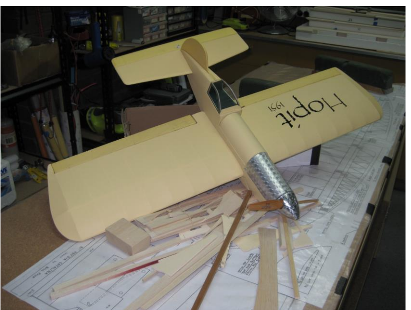
Thommo's Hopit, on the building bench

Here is a preview of what a Hopit looks like