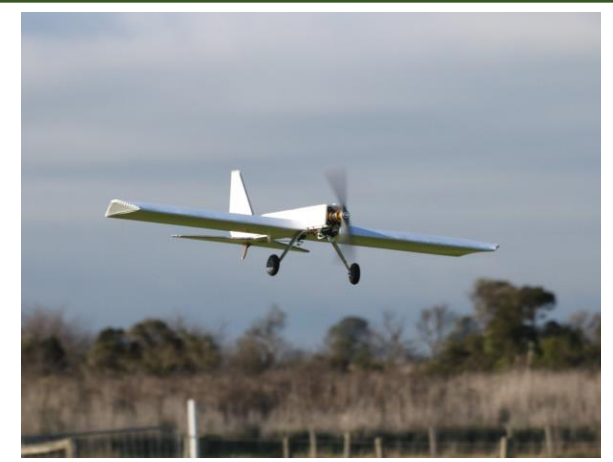
Frank McPherson's Coreflute model from SPAD Demon plans, took 22 hours to build. If it proves suitable , we may use the design for Combat / Musical landings / Limbo