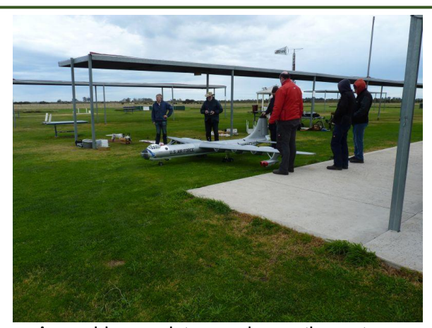
Assembly complete, running up the motors, ready for taxi testing