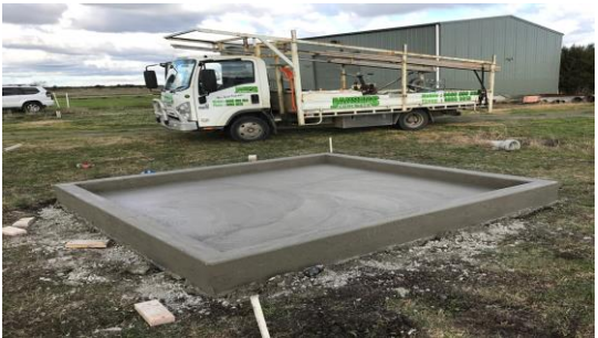
Fuel shed containment base