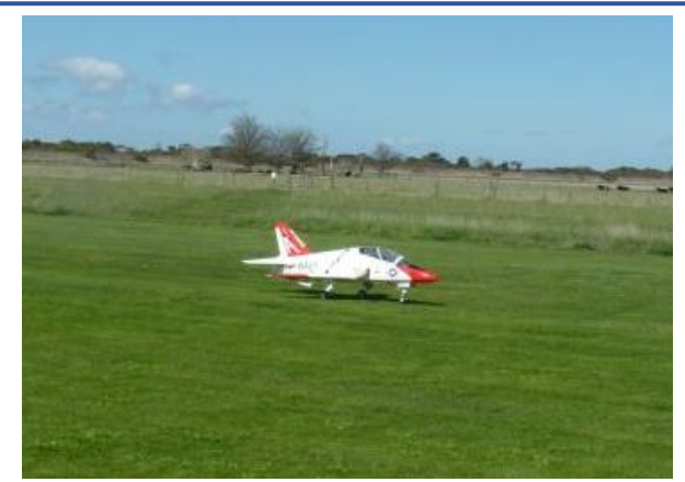
The fighter Jet on take - off run, Dave flew it well