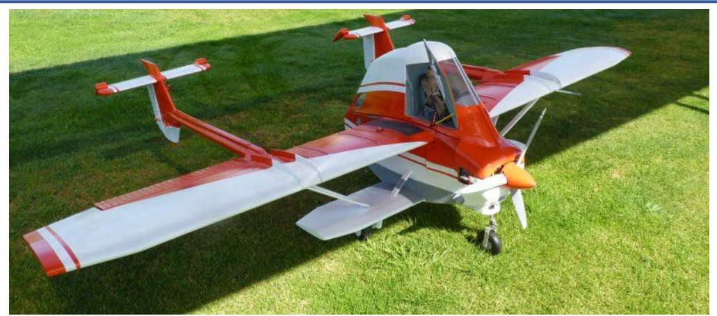
Dave Chivers big "Ag Truck"