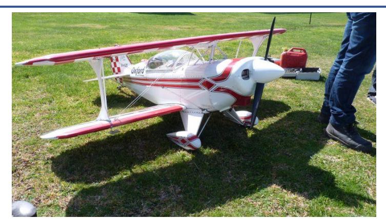
David Law's "Pitts Special" scale model