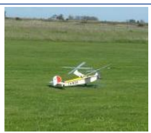
The twin rotor on take - off run, Brian flew it well