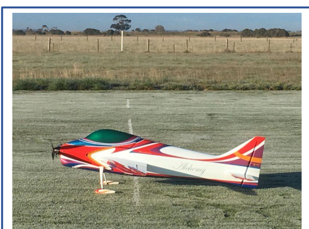
Geoff Healy's F3A model on the main strip on a very cold (-4 C) morning, notice the frost