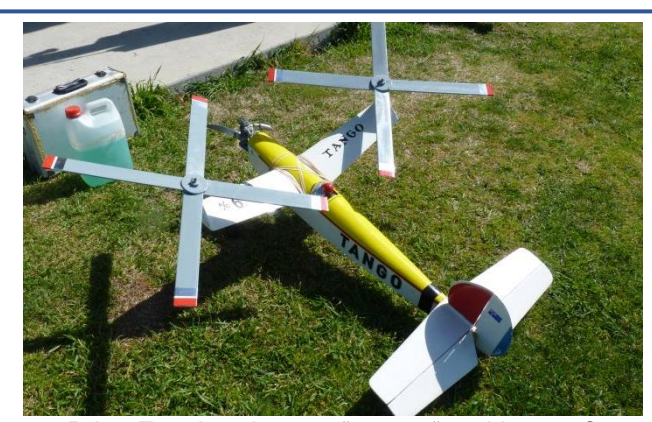
Brian Evan's twin rotor "tango" ornithopter?