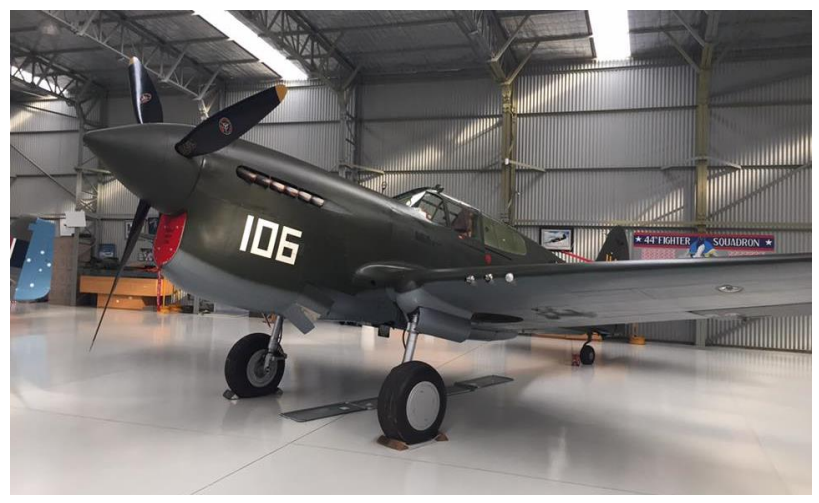
Cargo & Freight Company Tyabb