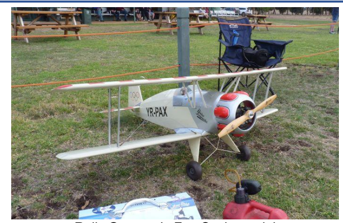
Rolly Gauman's Fun Scale model