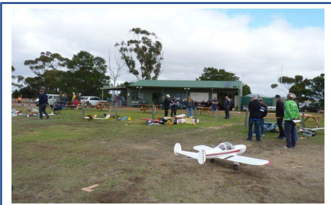
General view of the NFG Clubrooms and pits