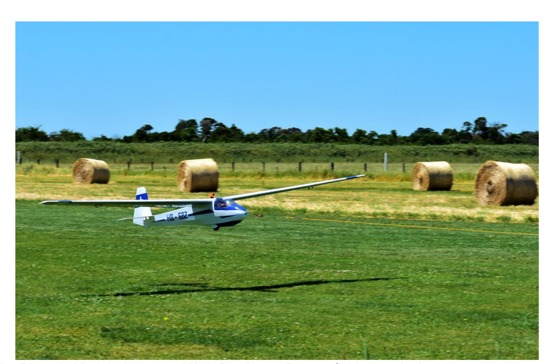
The Phoenix Models 4.5 metre KA8b "on the tow" at our field recently. In this case, the towplane was the Hangar 9 60cc Carbon Cub flown by Rob Barbuto.

Bigger is always better and a great sailplane to get started on is the KA8b, an older design but still relevant today. These ARF gliders are made by Seagull and Phoenix Models in a few different sizes from 3 metres to around 4.5 metres. Flying weights vary up to around 11 kgs, depending on the ballast needed.