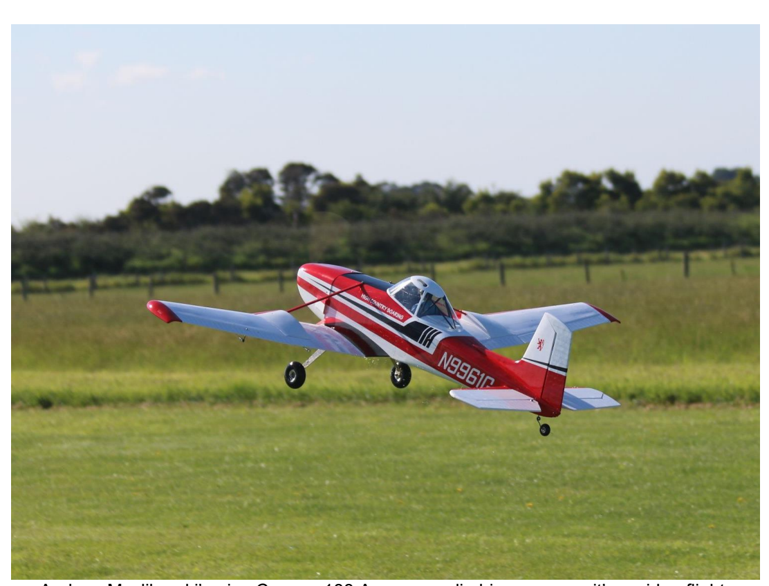
Andrew Mysliborski's nice Cessna 188 Agwagon, climbing away on it's maiden flight. Balsa and Ply, 1920mm Span, Flying weight about, 5 Kg, electric power

Next Club Meeting Saturday, 6<sup>th</sup> November, 1.00 pm at the Flying Field, all current Covid rules apply, could even be a celebration BBQ!