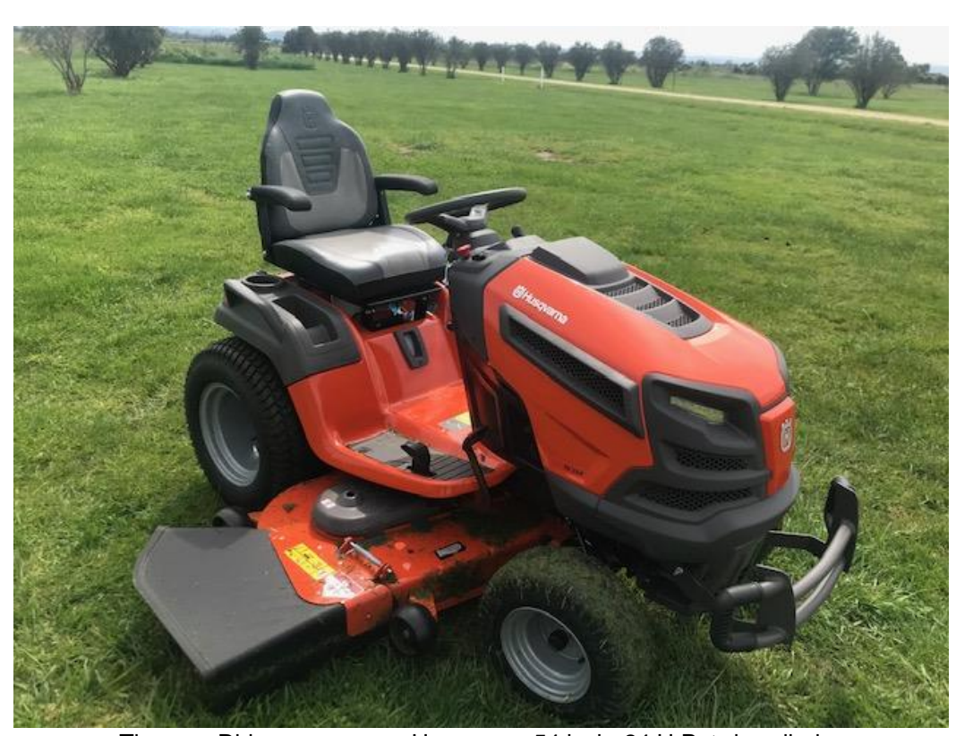
The new Ride - on mower, Husqvarna 54 inch, 24 H.P, twin cylinder

Apart from that, not much else to report on, but the field is ready to go once we are open again. I'm looking forward to catching up with everyone again soon.