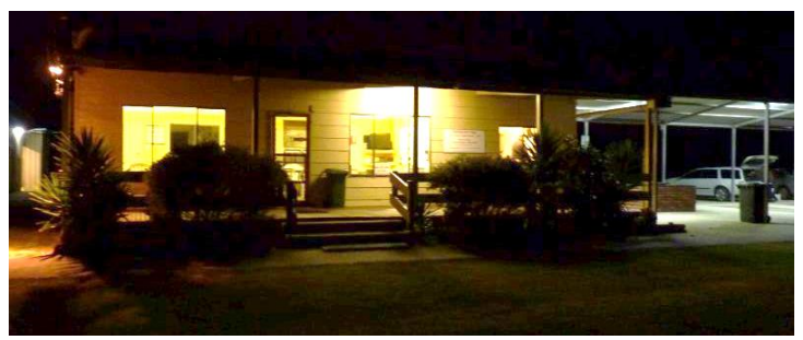
The P&DARCS Ranch