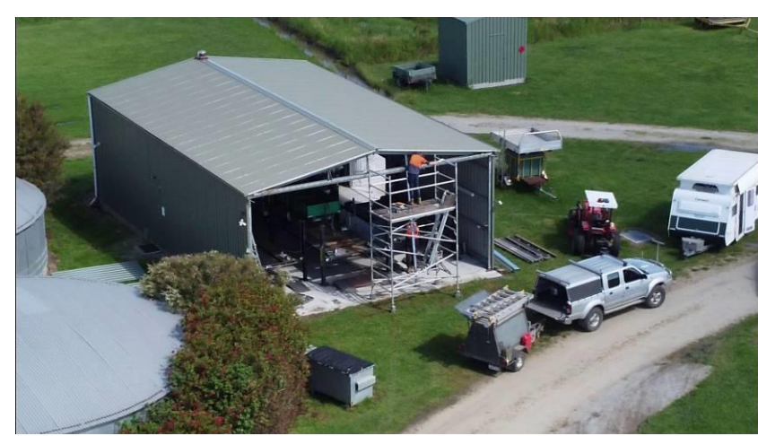
The Contractor starting work, Norm's caravan on site providing security for the contractor's tools and equipment overnight