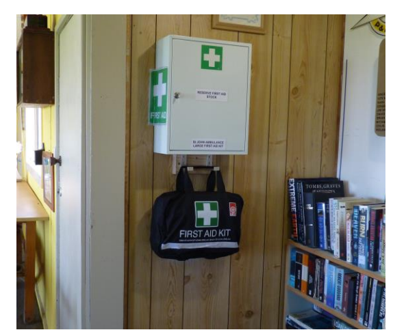
The new First Aid equipment, in the library alcove

The concept is, that AL L the first aid equipment, is located at the same place, with good visual signage, and be easily assessable