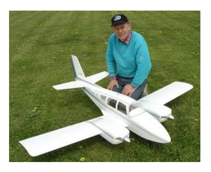
My scratch built 72" twin Cougar from plans provided by Don White

The plane was originally powered by 2 x OS 25s and was a little under powered. Just as I was becoming used to the flight characteristics I got caught out by turning into a tail wind after a cross wind take off resulting in a stall. The damaged plane has been in storage for the past 9 years. As a last lock down project, I have finally repaired the damage, now for the finishing and painting. I would also like to upgrade the power plants.