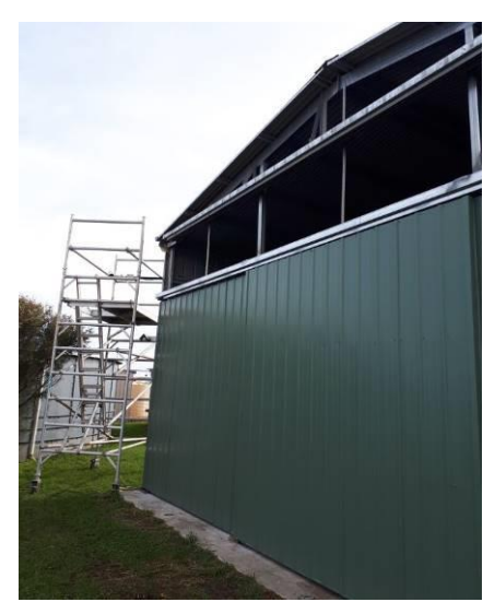
New doors fitted, shed now locked up, and all machinery now on the hoists, in case of a flood with storms predicted Top infills, and trims yet to be fitted