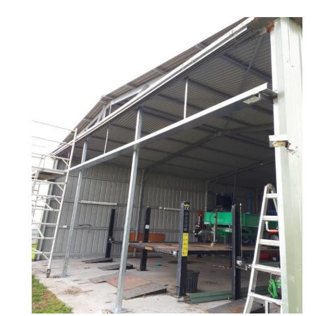
New top purlin + roof support posts bolted to the slab