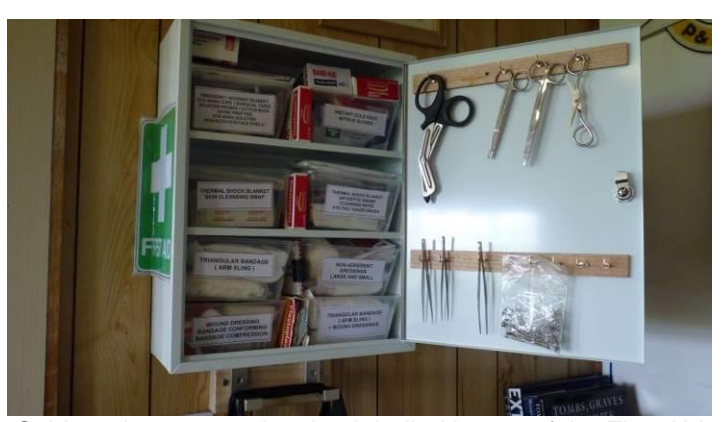
Cabinet door open, showing labelled boxes of the First Aid gear, various instruments on the door, and lots of Bandaids, the most popular dressing sought by Club Members!