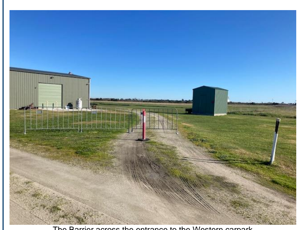
The Barrier across the entrance to the Western carpark

Once this area has dried out it will re open again.