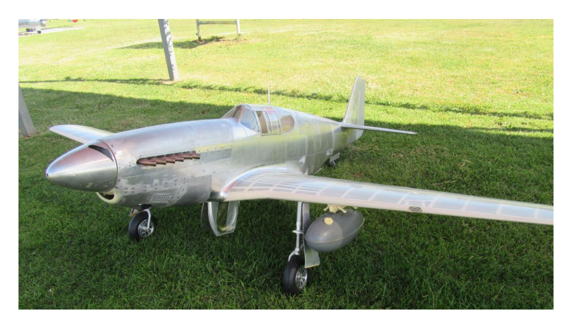
All Kit & Scratch Built Scale Aircraft welcome. No ARF's please. Construction Projects Most Welcome

Field Location; Wenn Rd. Cardinia, (50K East of Melbourne) Vic