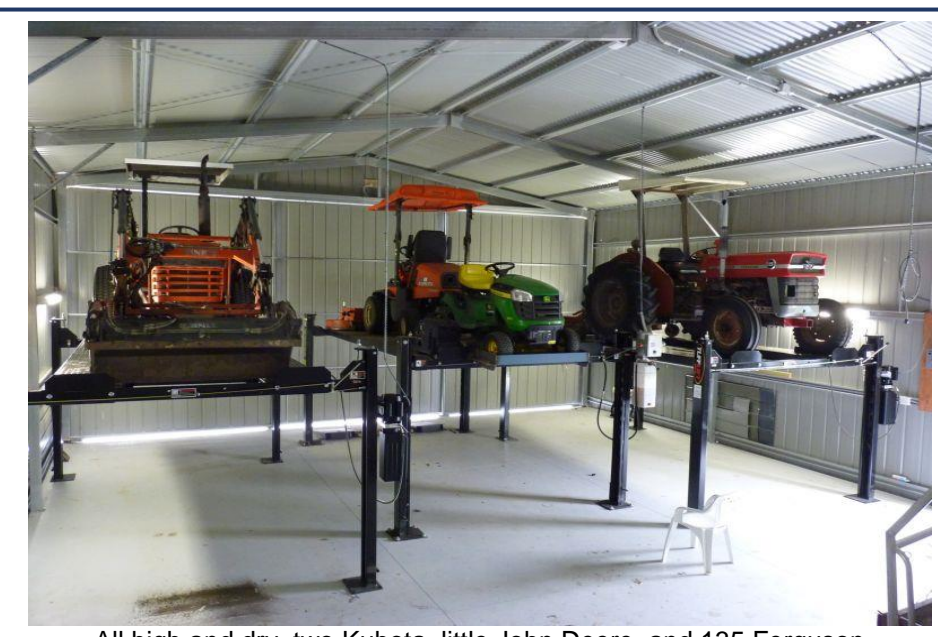
All high and dry, two Kubota, little John Deere, and 135 Ferguson