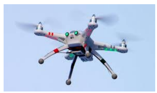
A typical drone

CASA breaks down drone operations into two categories: commercial and civil/hobbyist use, with different rules for each.