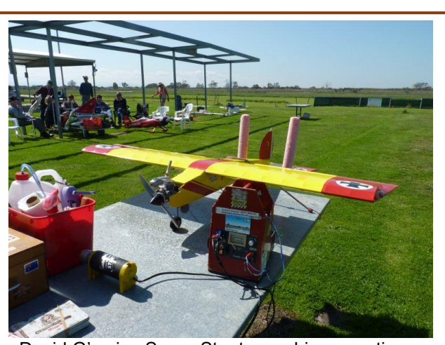
David G's nice Super Stunts machine, sporting a NEW O.S 46AX!