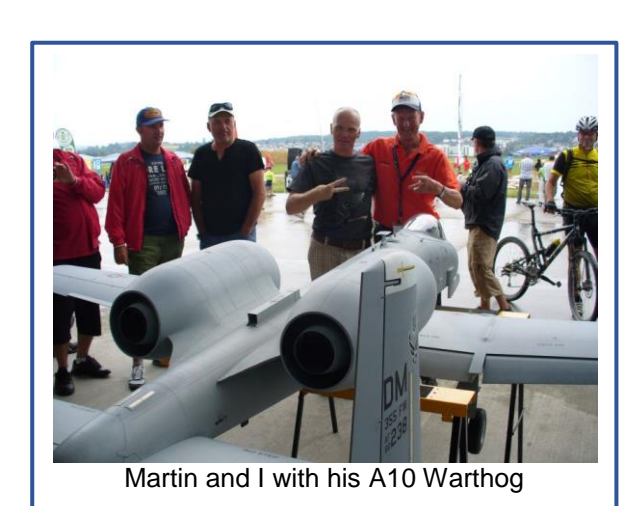
Check out the cockpit detail