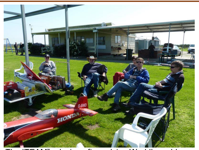
The "TEAM" relaxing after solving World's problems