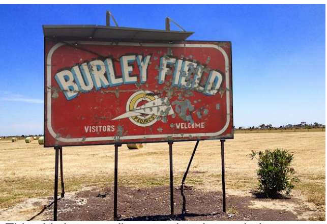
This old sign was discovered underneath the current one, looks a bit shot-up

We will be conducting a official unveiling of the sign which will be done by founding member of P&DARCS This will take place on Saturday 6<sup>th</sup> February before our monthly club meeting.