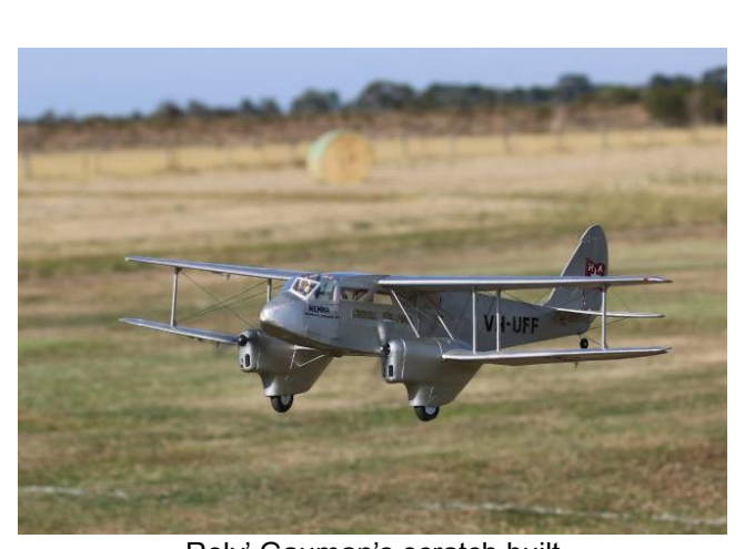
Roly' Gauman's scratch built De Havilland Rapide