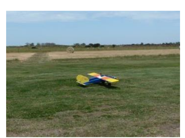
Twin Stick about to unstick, it flew, well smooth and easy to control