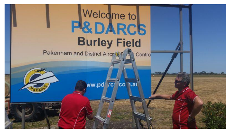
The Signarama contractors, installing the new sign