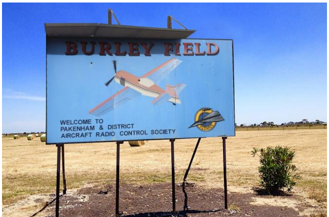
The current sign as we all know it, up until late 2015

Here are a few photos' of the work done, + a bit of sign history