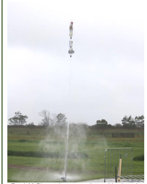
Frank McPherson's water rocket maiden launch on a wet and cloudy Monday, the wind got it, and it ended up on top of our large water tank, oops