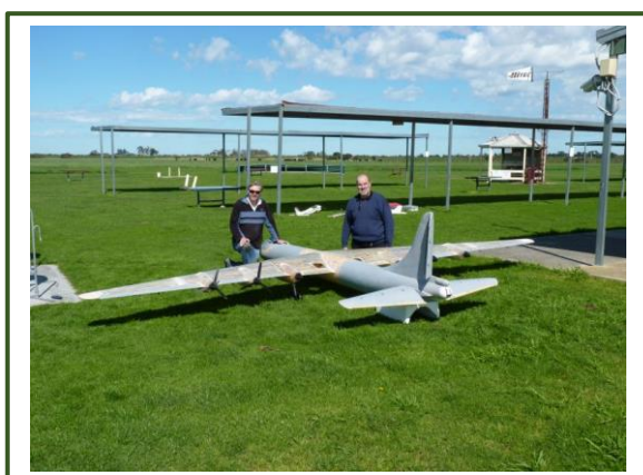
It all fits well, the B29 now needs much finishing work