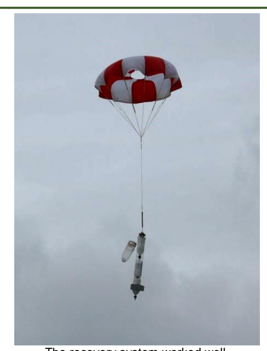
The recovery system worked well, Later, the chute got saturated with rain water, it got chucked out o.k but it didn't open