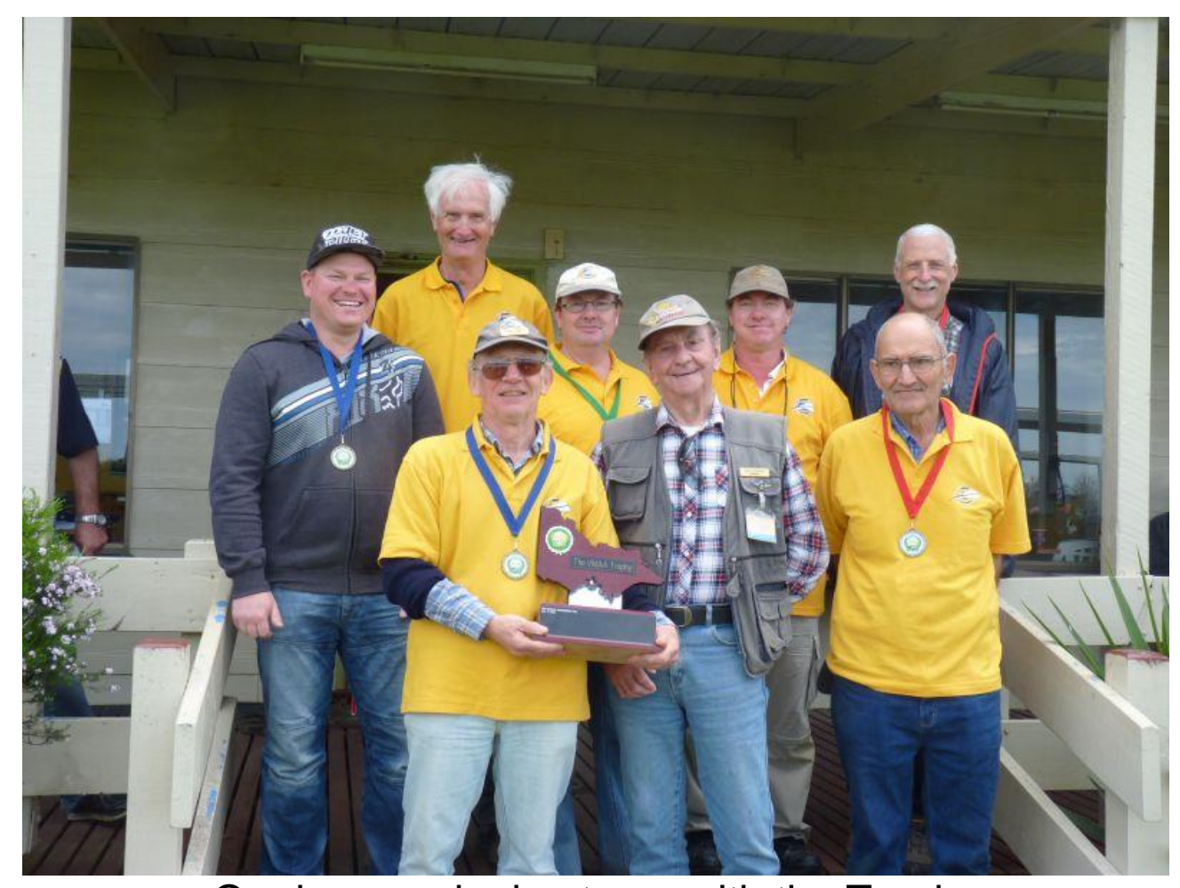
Our happy winning team with the Trophy