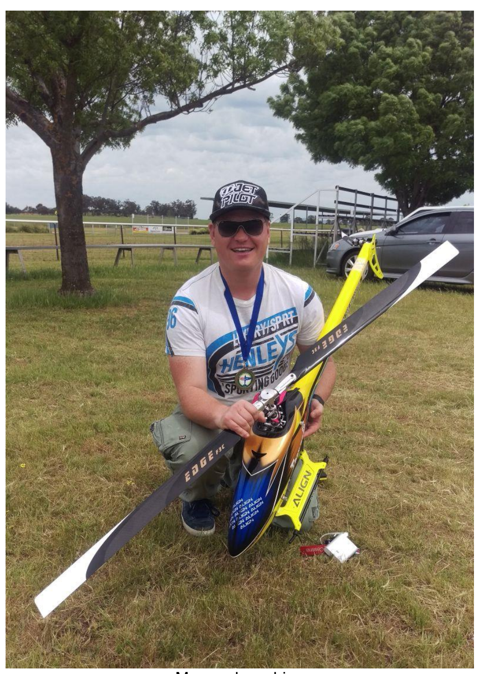
Man and machine