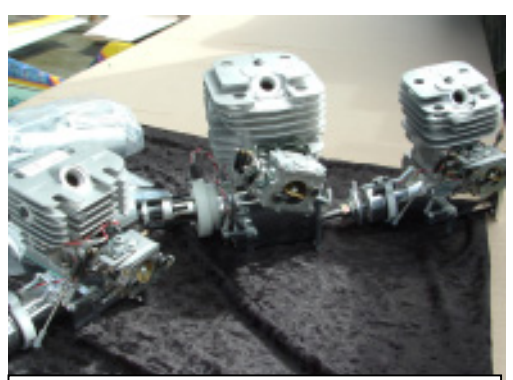
Davin is also importing a range of Brisson petrol engines. Very nicely built, electronic ignition and very reasonably priced. I think that the 98cc model is under a $1000.