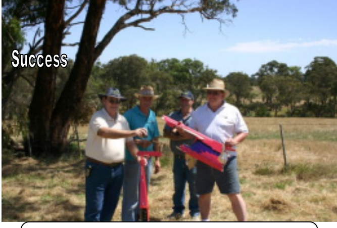
Gee look at this they are even posing for the mug column.