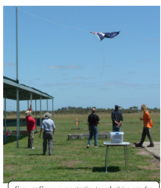
Come on Guys you are starting to make it too easy for me. Are you doing it just to get in the newsletter?