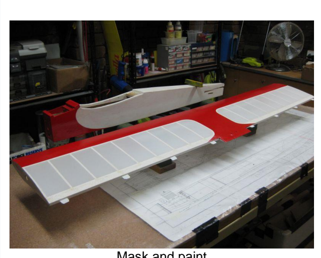
Mask and paint