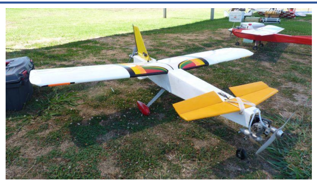
Brian Evans double ended machine, the orange canard is in front, it flew well,( for a while ) Brian likes to experiment with various designs, and it's good to watch them fly, seemed like it was flying backwards !