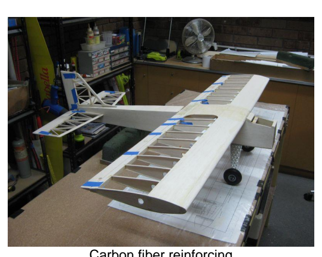
Carbon fiber reinforcing