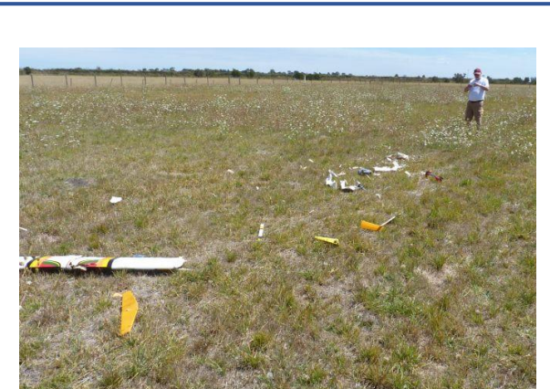
Brian collecting the useful parts, after the double ended model " kitted " itself at high speed, well spread out !