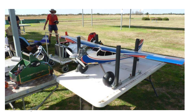
Paul Somerville's 60 size Boomerang, sporting rough country wheels, prior to an unfortunate argument with the ground, Bill' Renolds in the background