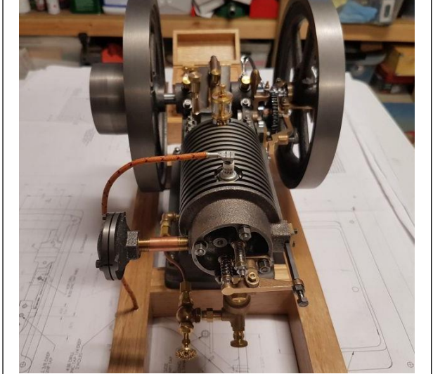
Rick Talman's very well made Red Wing model engine, it is 4 stroke, with a centrifugal speed control, that opens the exhaust valve, on a Hit & Miss basis