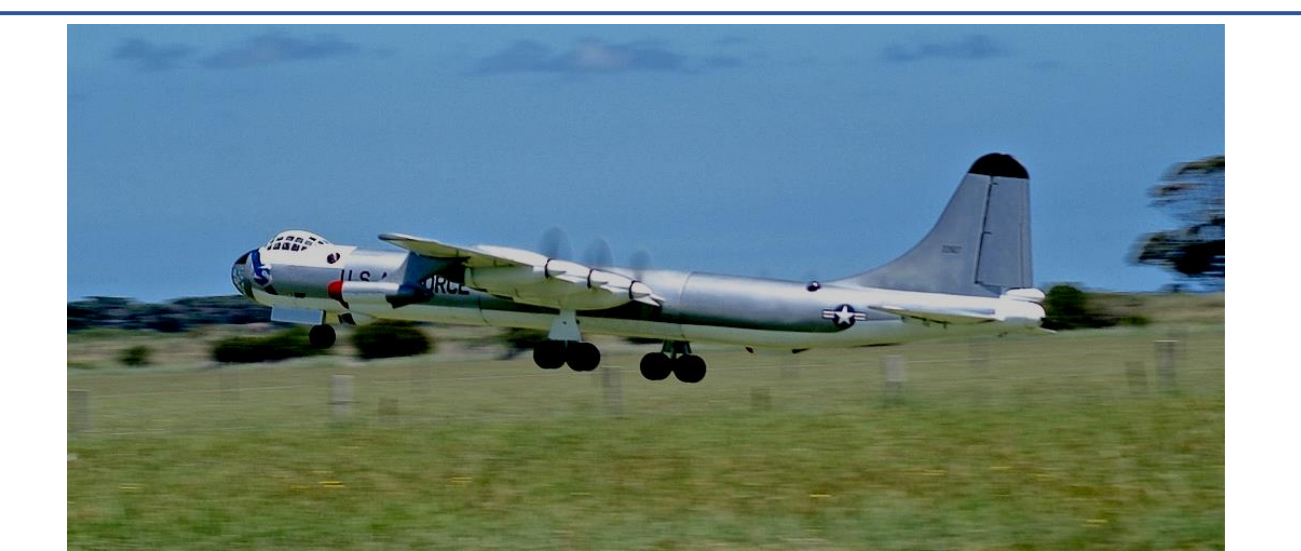
The big B36 lifting off for a perfect demonstration flight, in ideal conditions, flown by test Pilot David Law, assisted by the B36 team