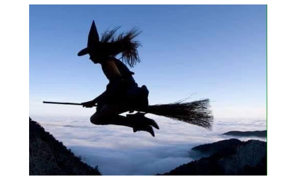
The flight under investigation, in marginal VFR conditions

ATSB are investigating yet another VFR / IFR incident which occurred the night before Halloween. (photos below). At this time the Bureau are attempting to identify which witch was involved.