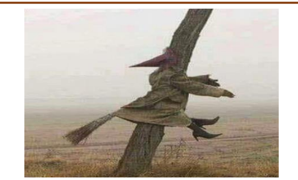
The tragic result, never fly VFR in IFR weather, ( cloud to zero feet )