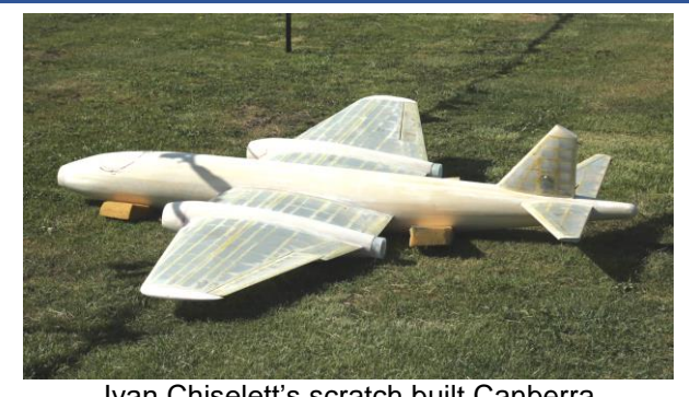
Ivan Chiselett's scratch built Canberra