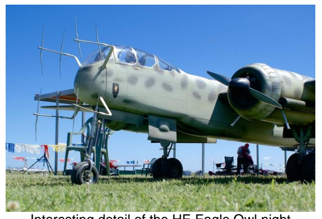
Interesting detail of the HE Eagle Owl night bomber