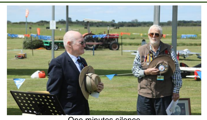
One minutes silence