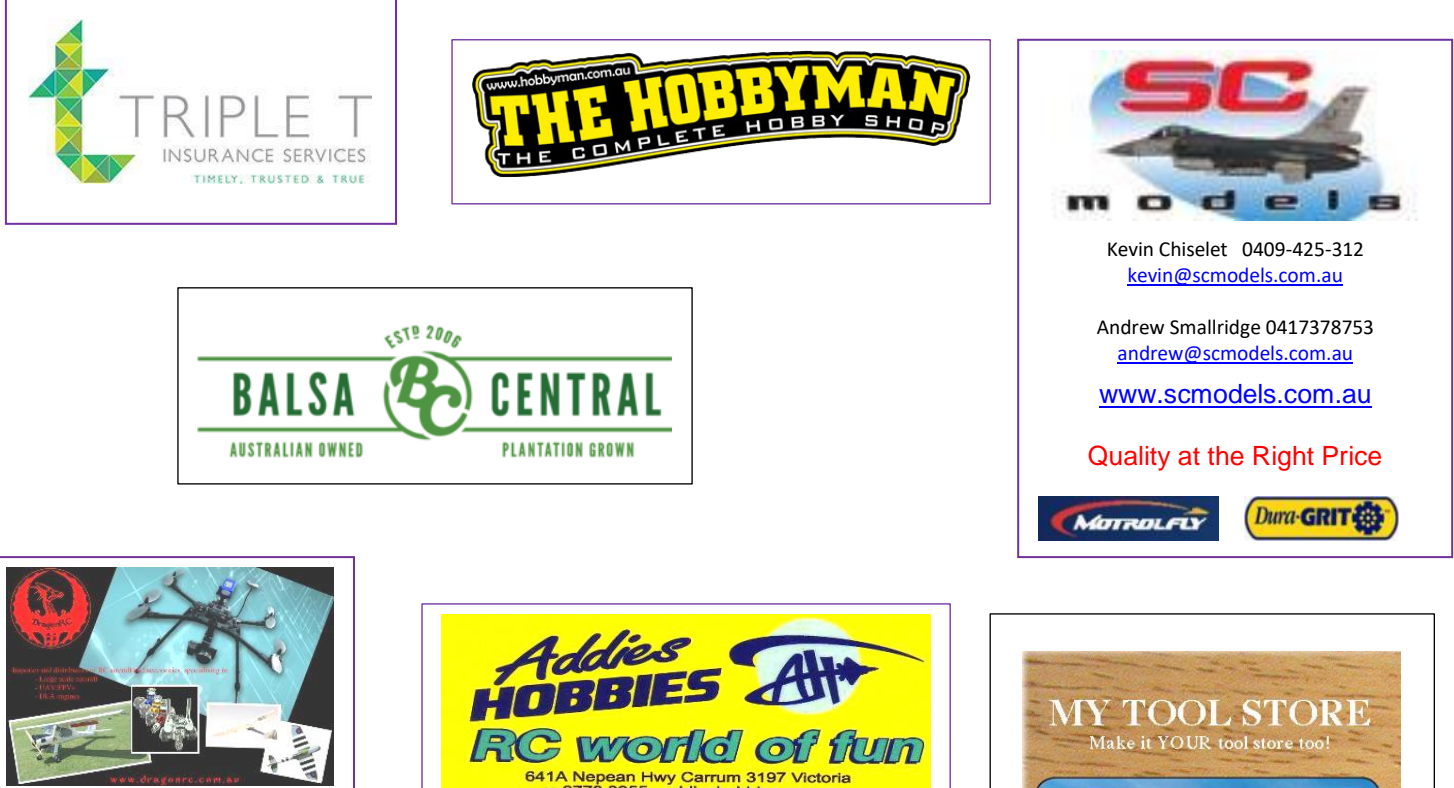
Dragon R.C Dragonrc.com.au