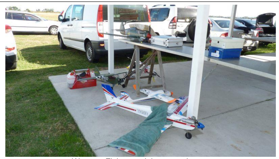
Western Flying model preparation area