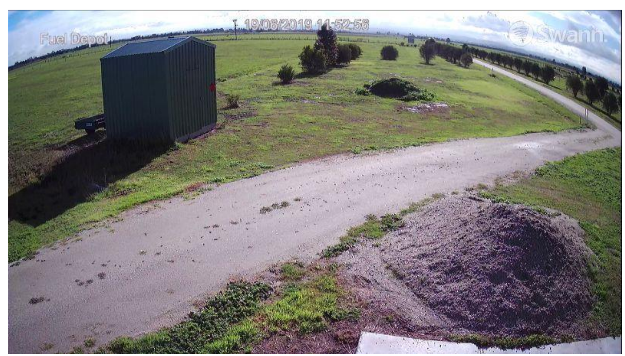
View of our fuel shed and driveway, looking North from the West end of the new shed The resolution of the image is vastly better than the old cameras