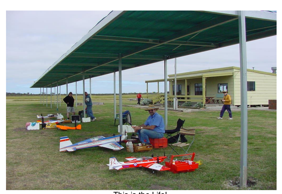
This is the Life!