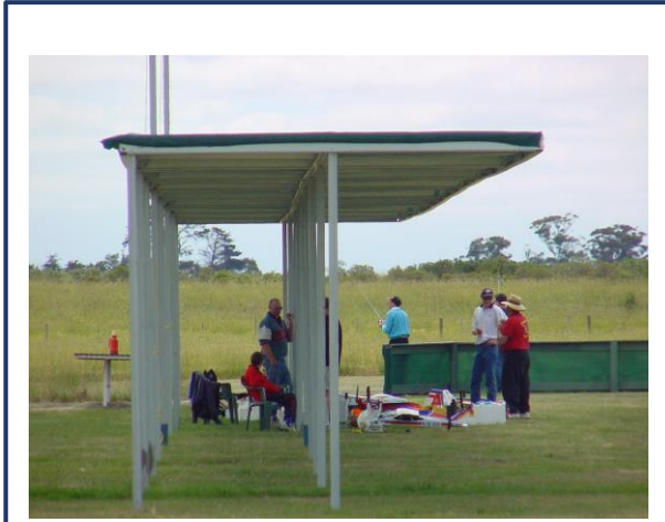
All Finished and pretty straight as well – What a Team.