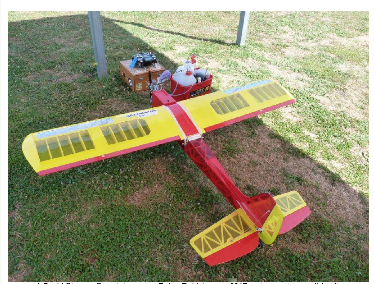
A David Glossop Gazariator, at our Flying Field January 2017, not sure who was flying it. Power is probably a 40 size glow motor

Club Meeting For September Via Zoom, see page 7 For Details