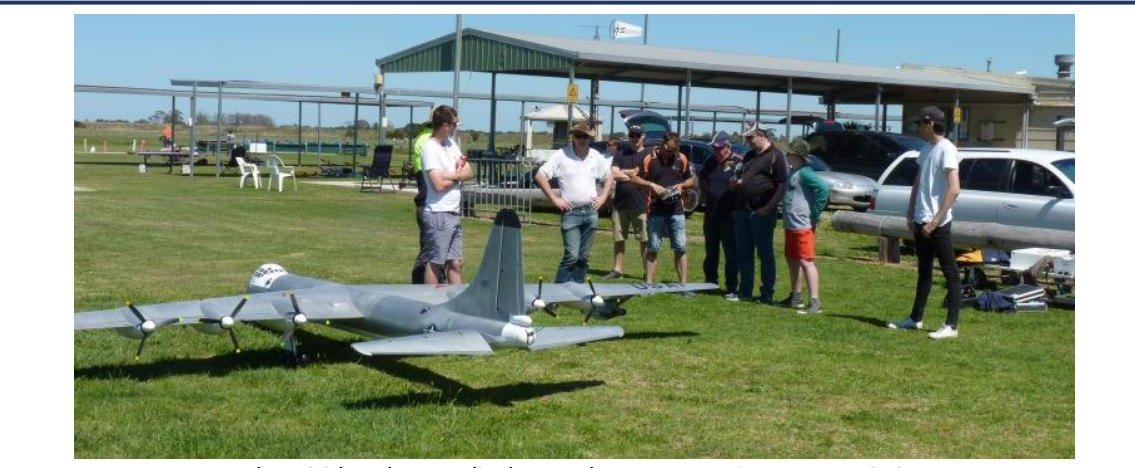
The B36 bomber on display, at the Eastern strip, August 1018