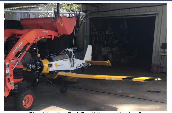
Checking the C of G a little unorthodox ?