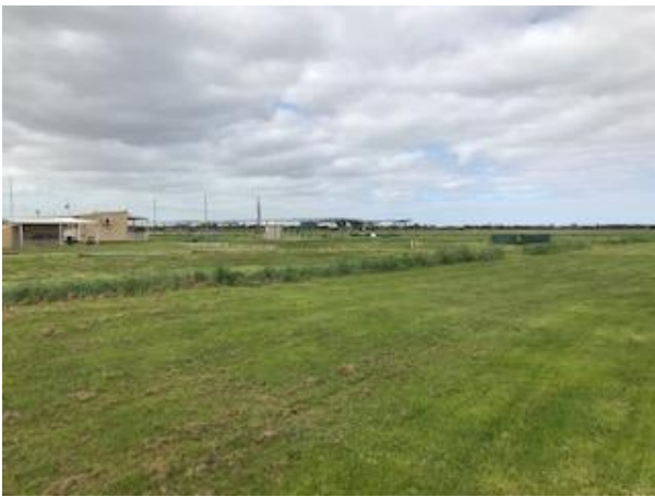
The main strip, also looking good, lots of loose cut grass at the moment