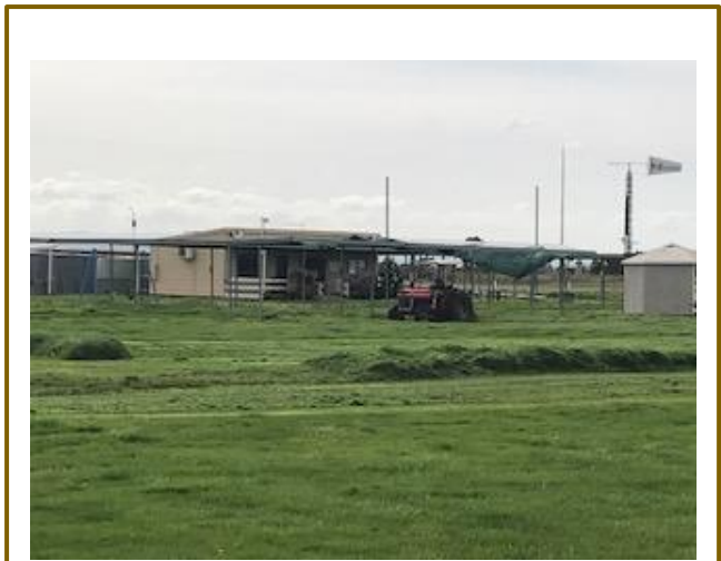
Heavy going in the pits