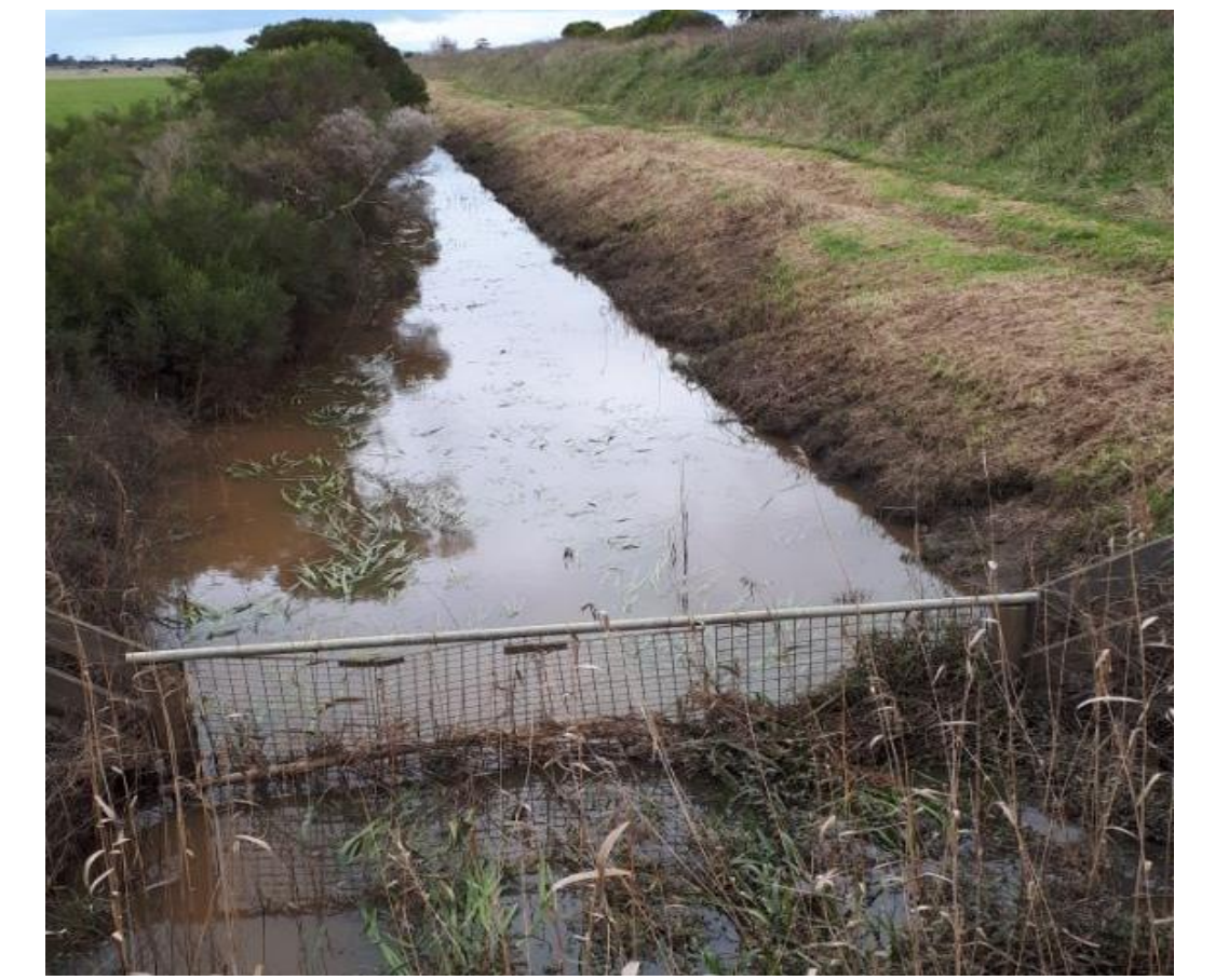
Gum Scrub Creek at Fowler Rd bridge, July 2020, Note the Illegal fence