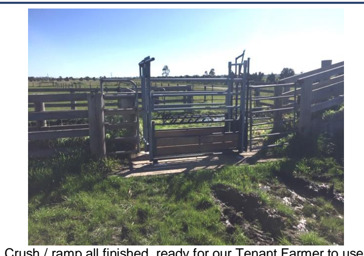
Crush / ramp all finished, ready for our Tenant Farmer to use. Very boggy surroundings