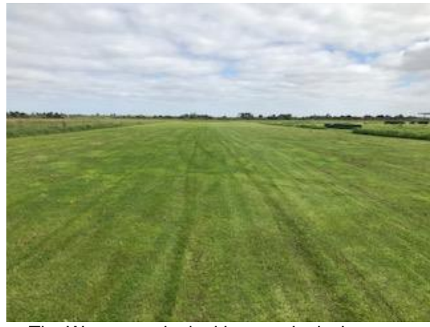
The Western strip, looking good, nicely green