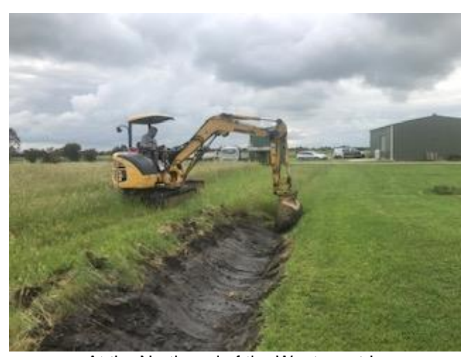
At the North end of the Western strip