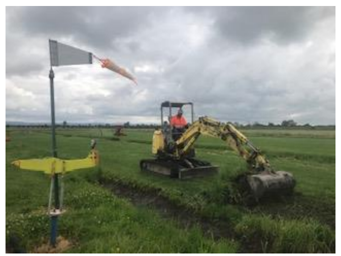
At the intersection of the East and Main strips

These photos show SOME of the works carried out