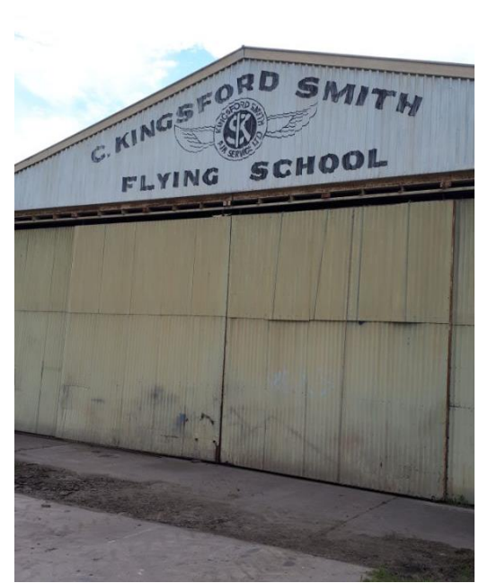
Interesting pic' from Norm Morish, old hanger on the Monash site at Berwick