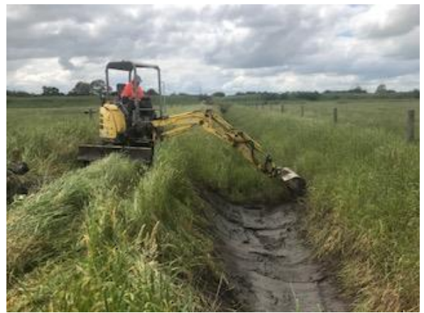
Extension of the drain under the North end of the Eastern strip, looking towards Wenn Road and the Eastern Badlands!