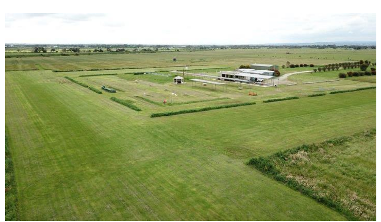
A recent aerial photo of the best model aircraft flying facility in the Southern hemisphere Looking from the Eastern end of the main strip to the North West

December 12th (Sat) 7 pm - 7:30 pm P&DARCS Christmas Zoom Drinks See calendar page for details