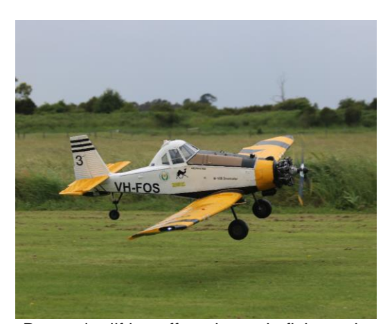
Dromader lifting off on the main flying strip