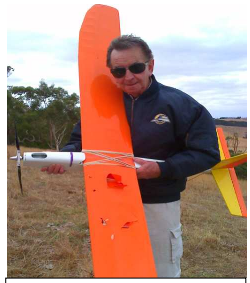
Looks like even an ordinary model will attract the attention of the wildlife.