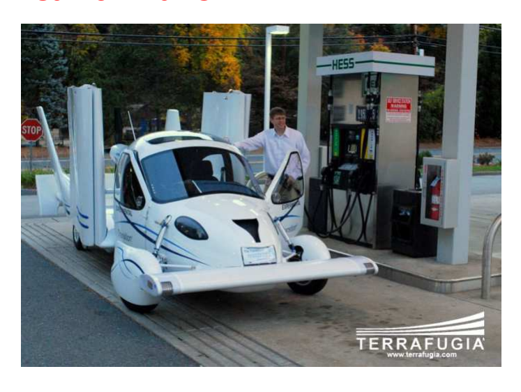
Find out at www.terrafugia.com