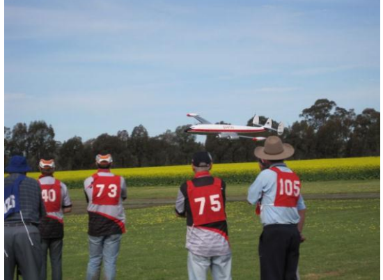
Model Engines Constellation, on a low pass, with the canola crop in the background

With the four engines, it sounded and looked magnificent in the air. Mike would do a high bank turn on the corner of the runway so people could get some great flying photographs