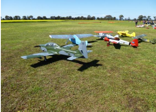
Another general view of the busy Event

On the second flight the landing was great as usual, but the model drifted and brushed the safety fence, and the port wing panel came off. I had a look at it later, and reckoned a couple of days work would fix it