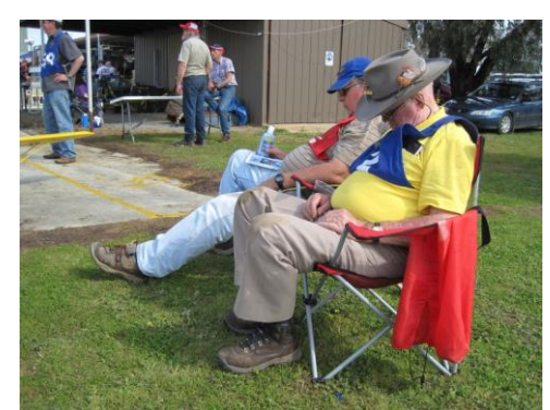
Relaxing after a big weekend