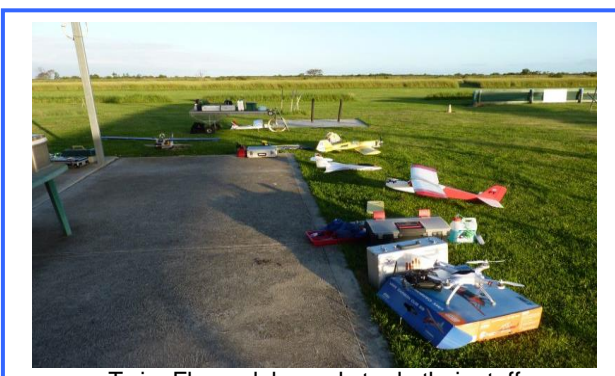
Twi - Fly models ready to do their stuff