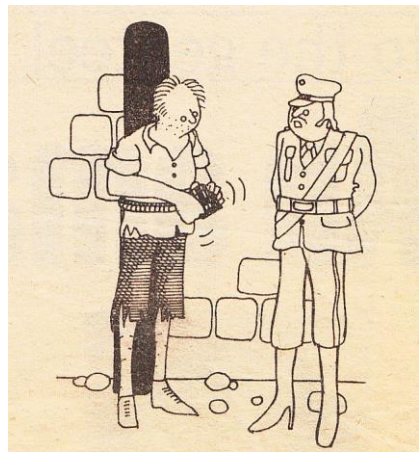
This is the last time we grant a Rubics Cube as a last request