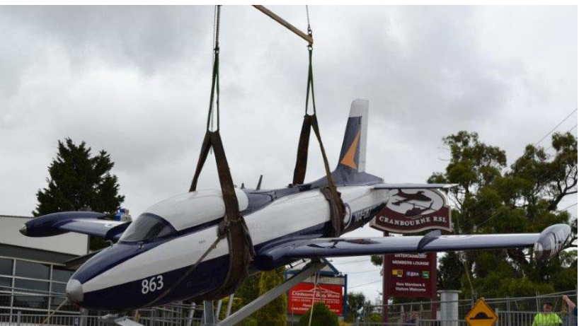
On site, lifting the Macchi, and pylon bolted together

On site the wings were fitted and the many cowlings etc fitted, then the aircraft was lifted by slings to bolt onto the pylon via special brackets mounted to the undercarriage mounts, then it was lifted and swung onto base of pylon and bolted down.