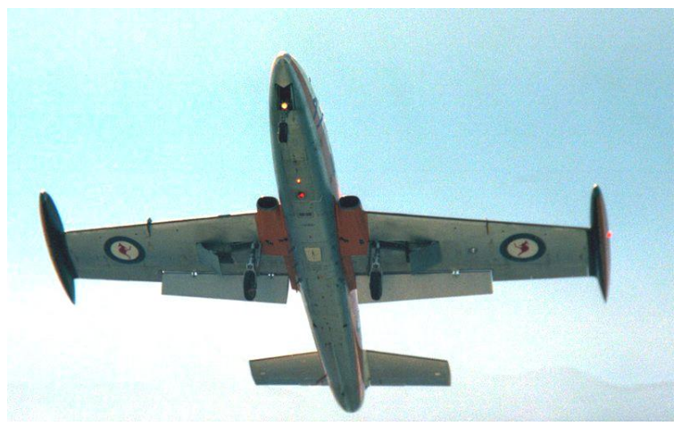
An RAAF Macchi MB-326, off Fremantle during a flypast of Australian aircraft carrier HMAS Melbourne, circa August 1980 (note the wing flaps deployed)

They were powered by an Armstrong / Siddeley ---Rolls Royce VIPER JET Engine, also made at C.A.C.