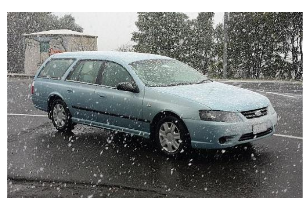
Geoffs car at Ballarat on way to Horsham, lots of snow