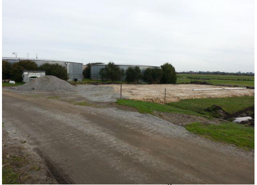
The shed site as at 24<sup>th</sup> August

Local Council planning executive are about to sign off on authorizing provision of out permit Earth works require final leveling, and compacting, and it is envisaged we will be able to start construction when the warmer weather arrives