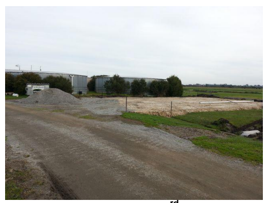
The shed site as at 23<sup>rd</sup> October

Safety Steel Products have produced the shed and are holding it in storage waiting for a suitable time to start construction on site, possibly before Christmas