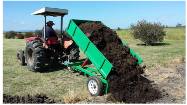
Tipping, about 5 loader bucket fulls