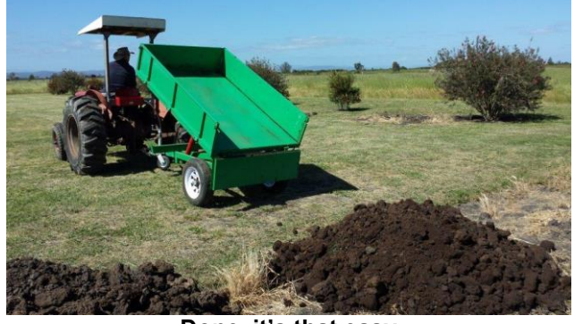
Done, it's that easy