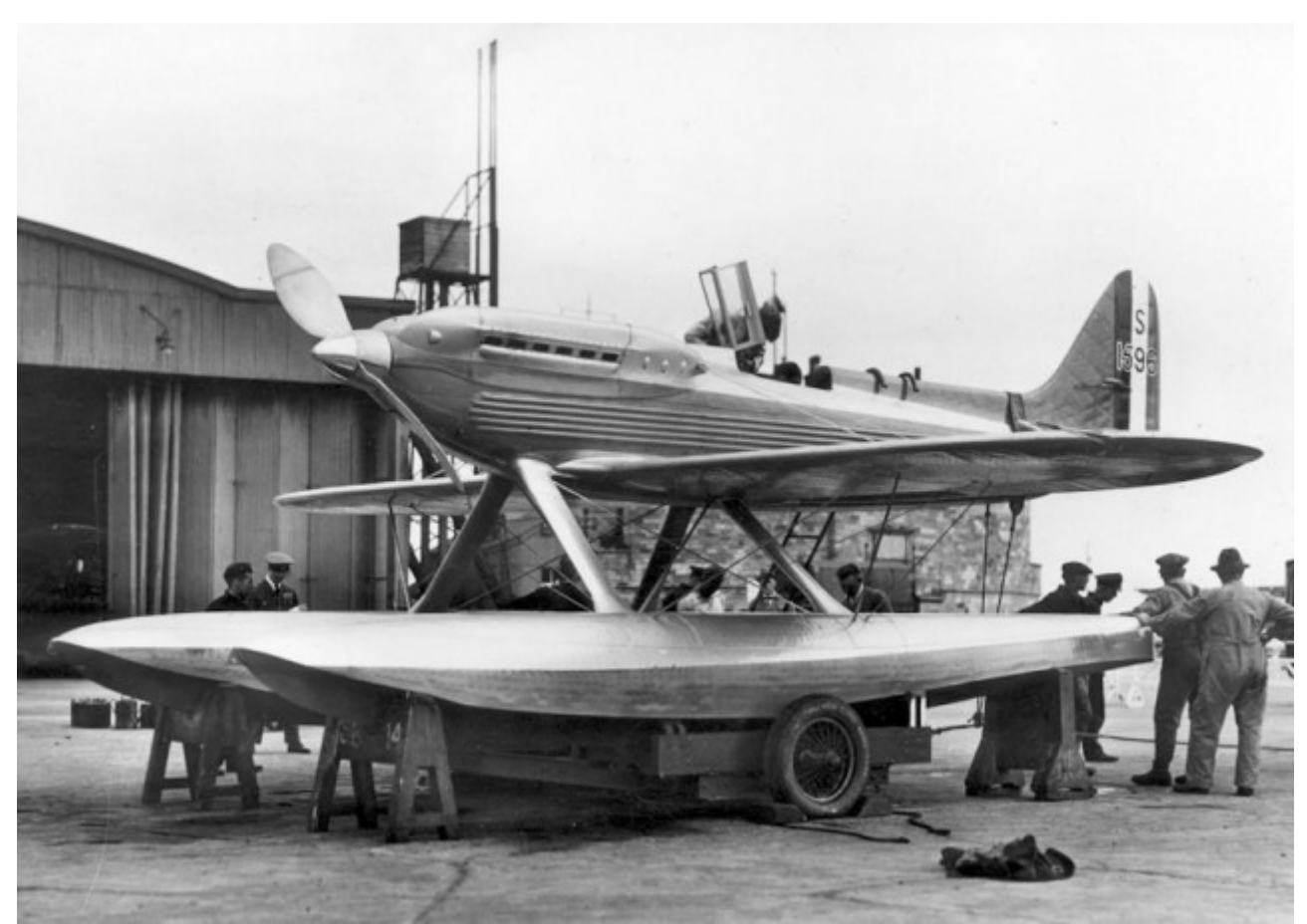
Note the pitch of the propeller, ( not providing much thrust for take - off , but a high top speed )

The winning speed at the last Schneider Cup race held in 1931 was 340 mph, but not long after the S.6B set a new world record of over 400mph!