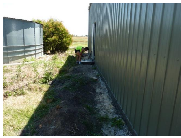
The side door step