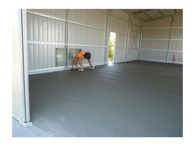
Finishing the edges