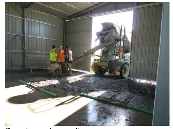
Dumping and spreading