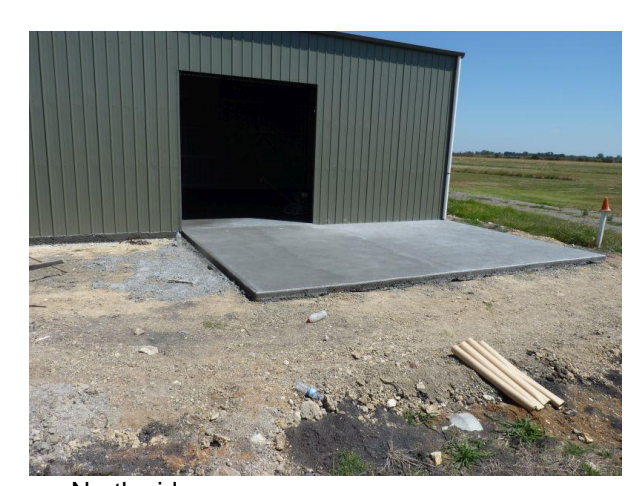
North side apron