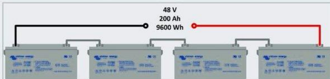
Four batteries in series.