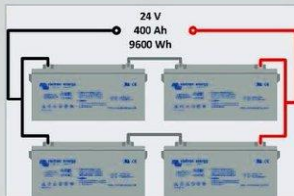
Four batteries in series/parallel.