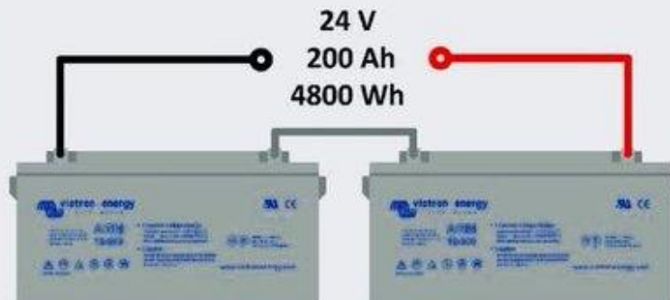
Two batteries in series.