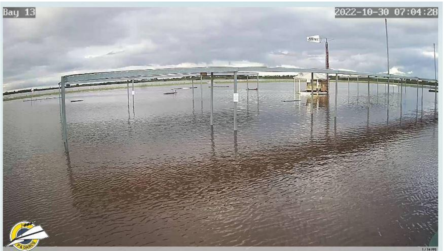
Bay 13 - 7am Sun 30 th on Oct 22