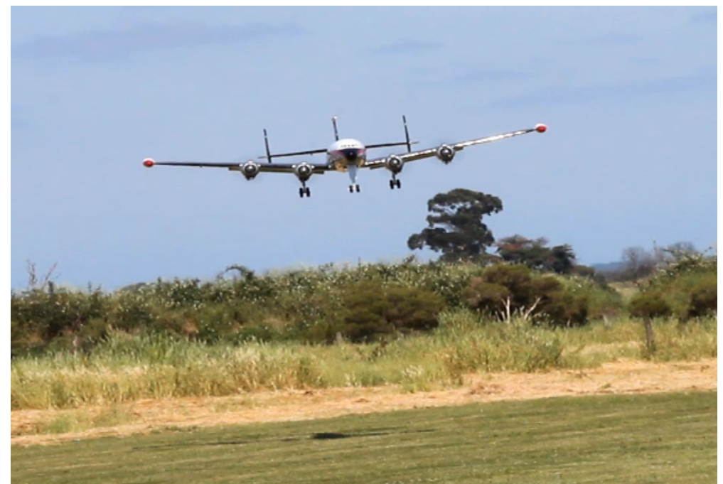
Model Engines Super Constellation on final approach over the West Bank