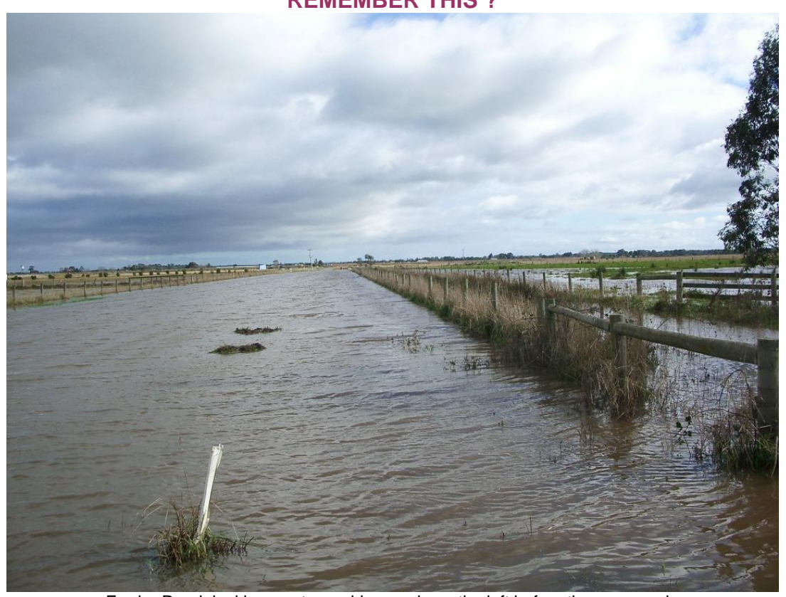
Fowler Road, looking west, our driveway is on the left before the power pole

THE LAST BIG FLOOD COST $8,000 FOR REPAIRS TO OUR EQUIPMENT