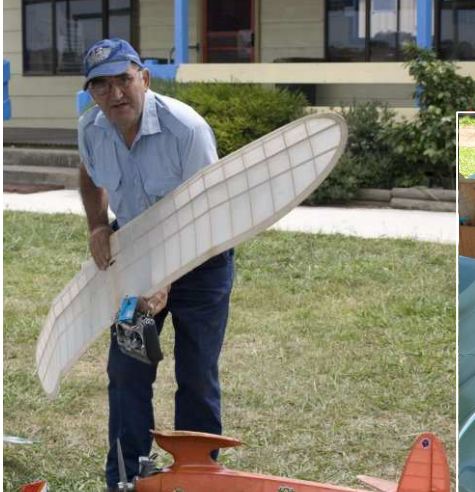
Photo of Stearman taken by Wal Schubach at the Hamilton Fly In. 215 cc five cylinder radial swings a 32 x 10 or 34 x 12 prop. This is a Big Model