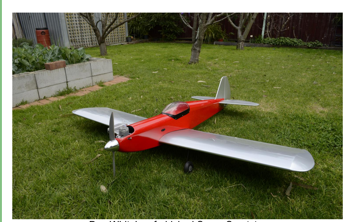
Don White's refurbished Super Sportster Repaired / repainted / recovered / re-engined / a top job, Don Plans to do the first flight soon