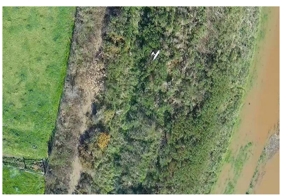
The recovery shot of the Radian, the Eastern main drain on the right, Wenn Road should be on the left?