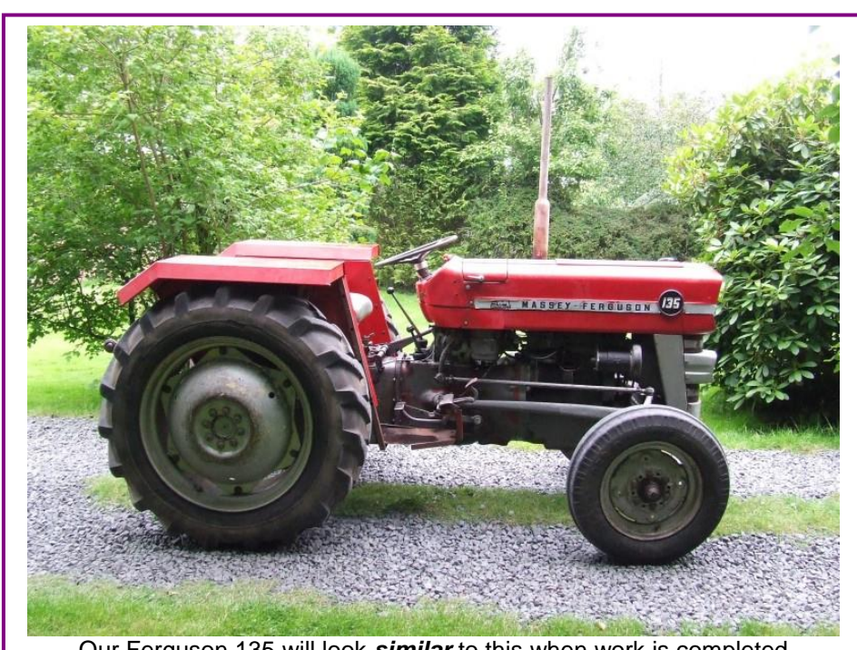
Our Ferguson 135 will look similar to this when work is completed

Frank, the Twi – Fly Boomer is heavy, keep some power on to land it, plus don't get stuck into the beer before flying!