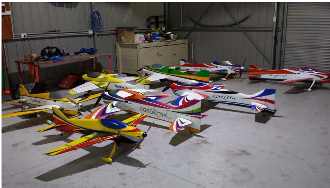
Overnight parking at P&DARCS